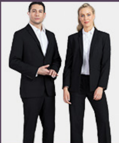
Suits pg 14-15