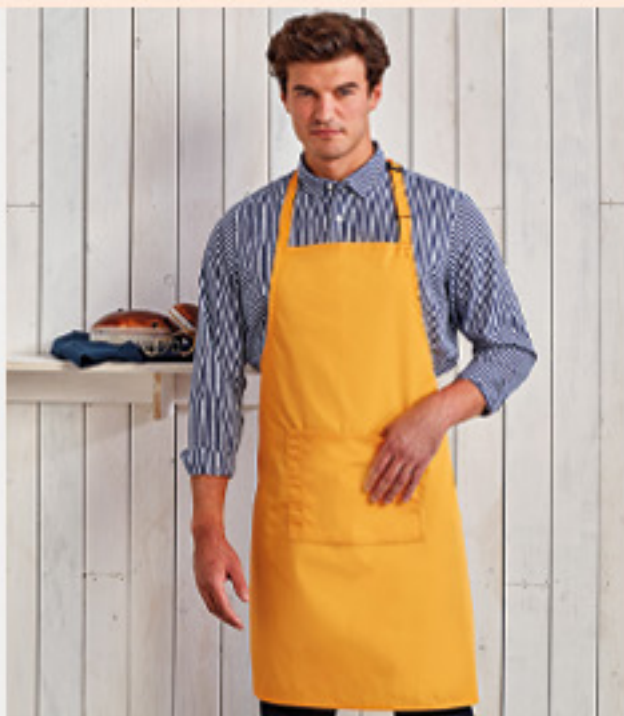
PR154 | BIB APRON Black Blue Grey Lime Magenta Orange Red (many other colours)