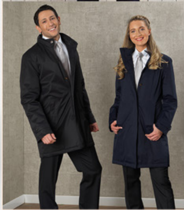
9987 | RAINCOAT Black Navy Size Mens 36 - 50 Ladies 06 - 24