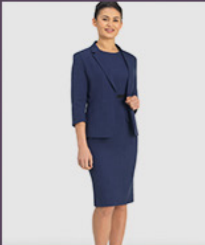
Pero Jacket pg 4