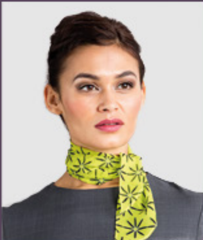
Accessories pg 16-20