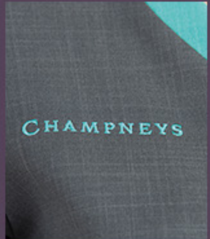
Branding pg 22