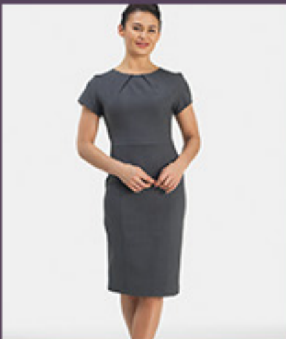
Ancona Dress pg 7