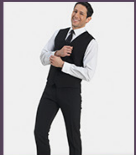
Waistcoats pg 10-11