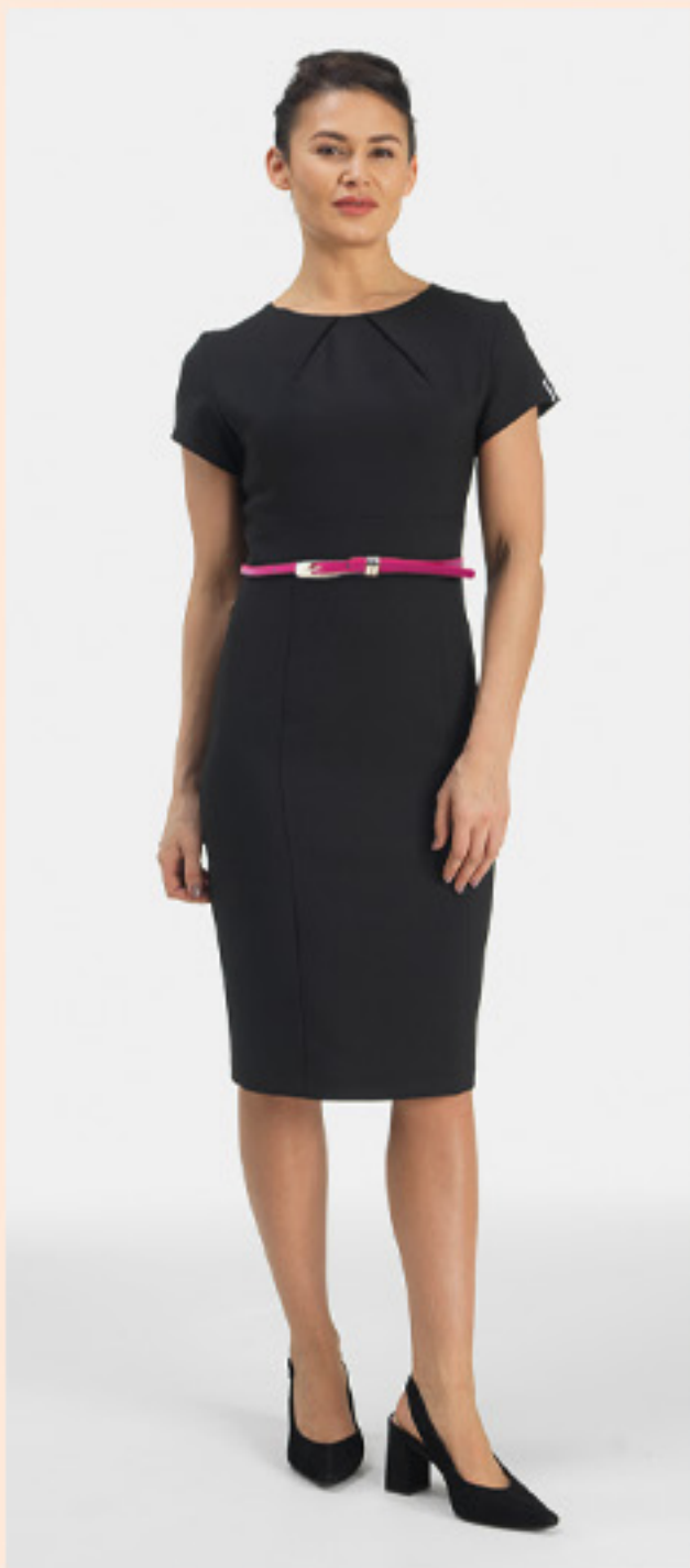
A99 | SKINNY BUCKLE BELT Blue Grey Lime Magenta Orange Red (min qty 100 students)