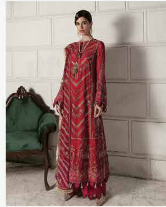
06 ROSEATE BELLE (9,950/-)