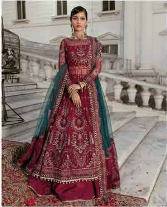
09 MAJESTIC REINE (12,500/-)