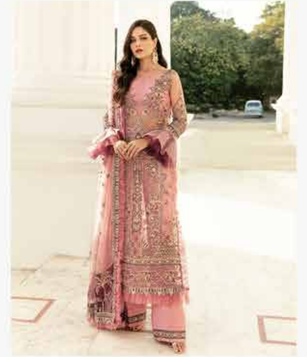
03 ROSE SHELL PINK (10,500/-)