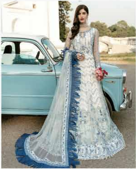
01 CELESTIAL DREAM (12,500/-)