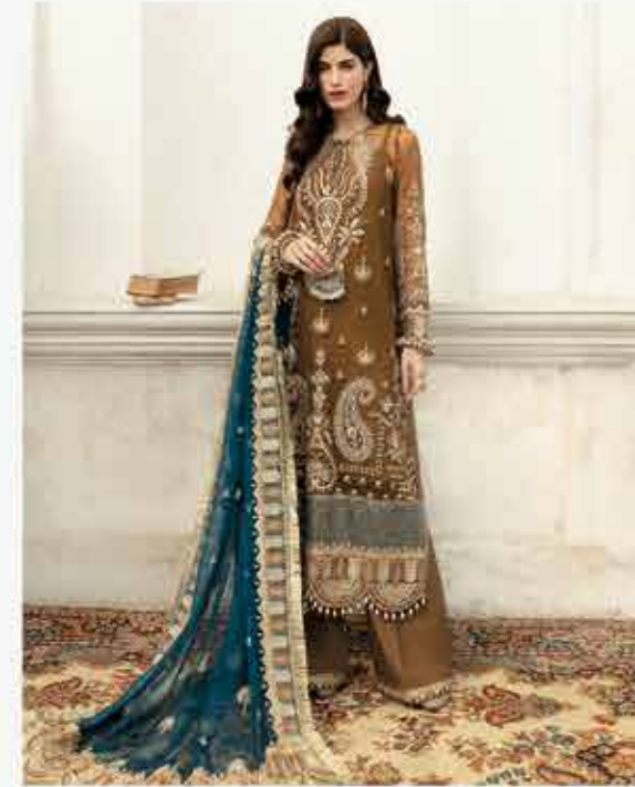
08 IMPERIAL BREW (10,500/-)