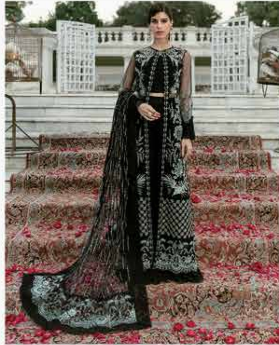
10 NIGHTINGALE (11,500/-)