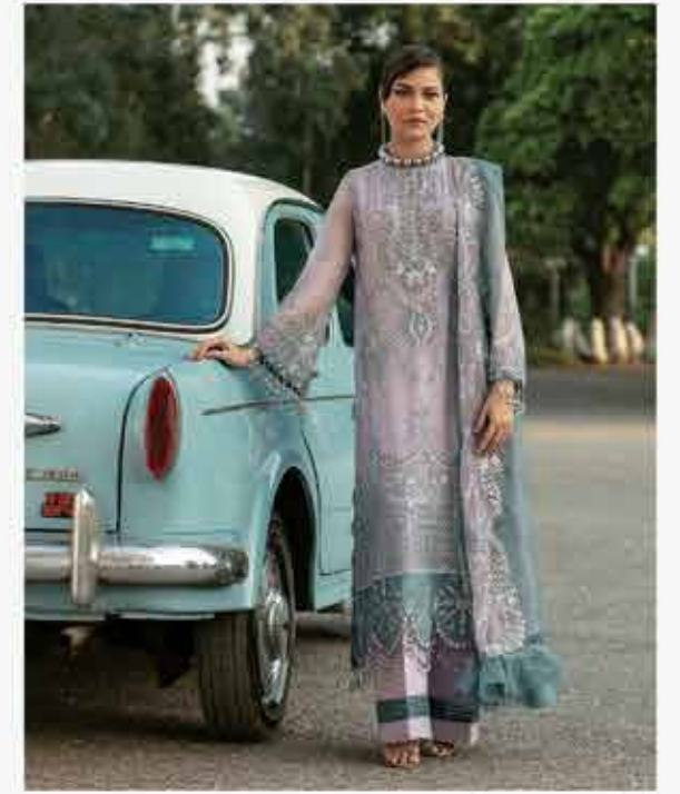
07 PIXIE DUST (9,950/-)