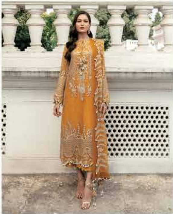
05 GOLDEN HOUR (10,500/-)