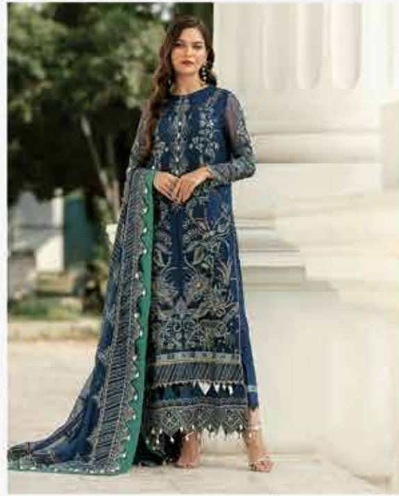
02 STELLAR BLUE (11,500/-)