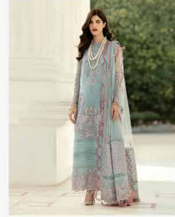
04 SERENE SKY (10,500/-)