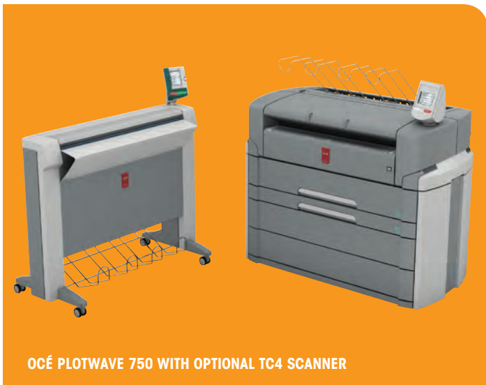
OCÉ PLOTWAVE 750 WITH OPTIONAL TC4 SCANNER

Meet short deadlines and work efficiently with the instant-on performance of Océ Radiant Fusing technology. Get over 27 D-size (A1) size prints, before others have even started printing and consistently turn out 9 D-size (A1) prints per minute, even with mixed sizes. With 6 media rolls, the Océ Double Decker Pro stacker and built-in cutters, you can print and stack up to 3,444 feet (1,050 meters) of output without interruption. Scan and copy as-builts, color markup and other technical documents in one quick and easy step for immediate archiving and distribution.