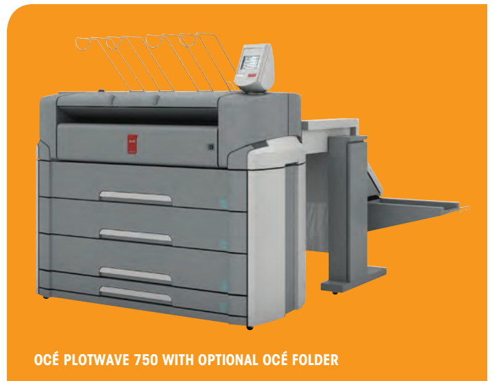
OCÉ PLOTWAVE 750 WITH OPTIONAL OCÉ FOLDER