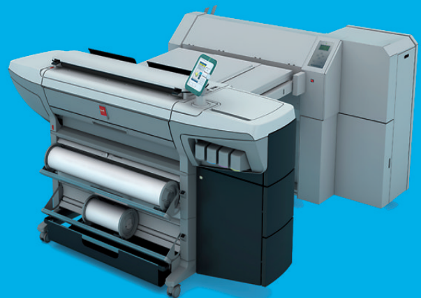
with Océ estefold 4211