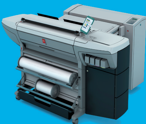
with Océ estefold 2400