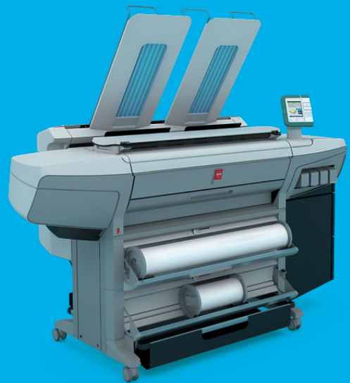
Océ ColorWave 300 T