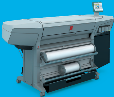
Océ ColorWave 300 R