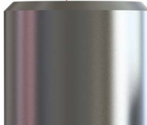
Figure 3 – Unflared Shaft End