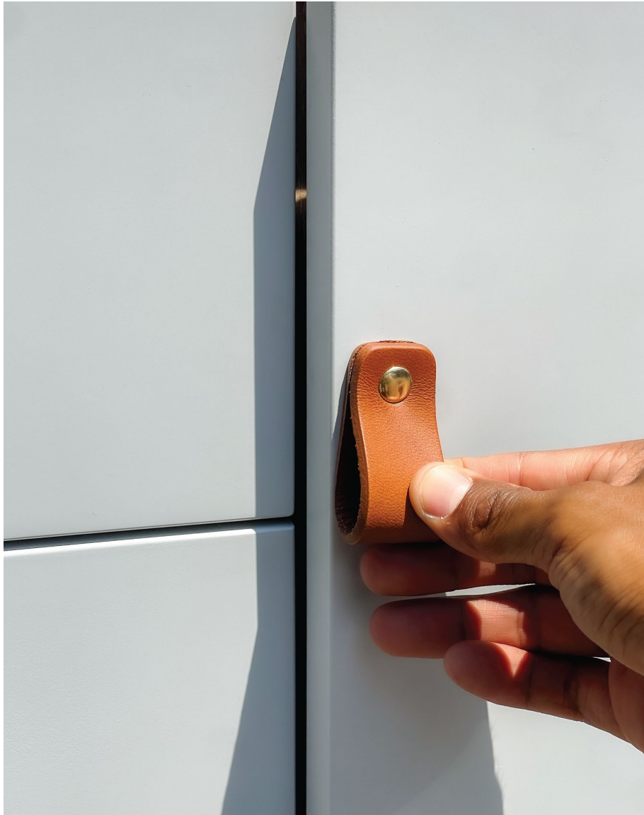
LP02 | LEATHER LOOP PULL PRODUCT SHEET