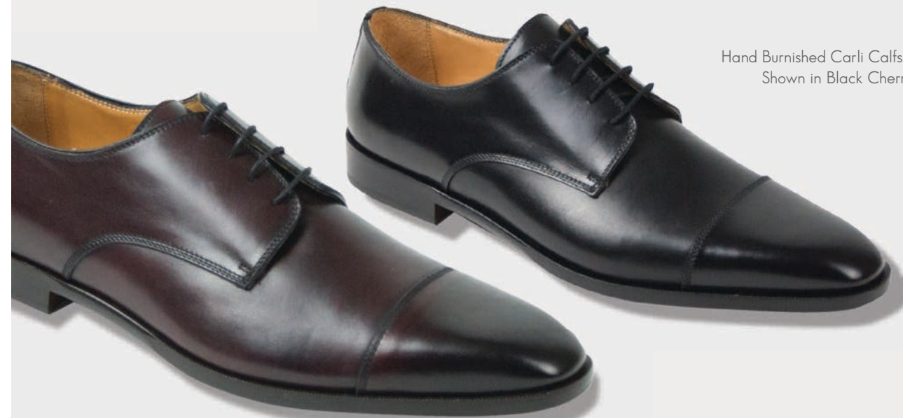
◀ ENZO Leather Sole Hand Burnished Carli Calfskin #25-533 Shown in Black Cherry and Black