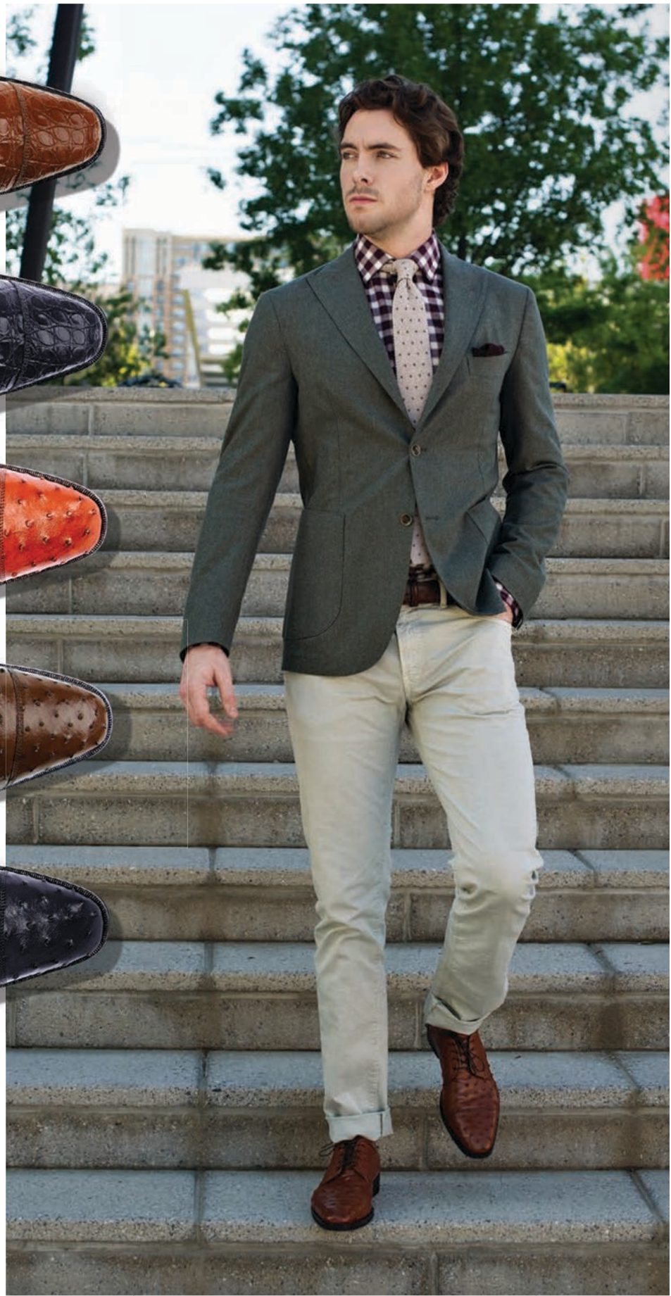
ANDREA ▲ Smooth Vibram Sole Crocodile #21-532 in Cognac and Black Ostrich #23-538 in Brandy, Brown and Black