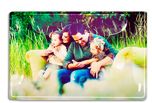
Family Photograph Fit To Fill Tray; 8"x 12," #DPC-812