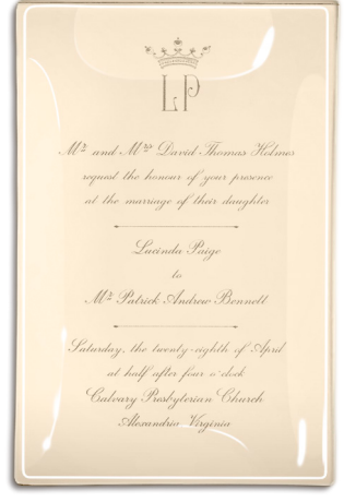
Center Letterpress Invitation; 9"x 14." #DPC-914