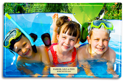
Family Photograph Fit To Fill Tray With Simple 2-Line Caption; 6"x 10," #DPC-610

A best, must-have gift. Frequently featured in our favorite magazines & even Martha adores hers.