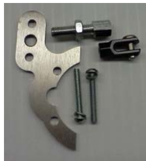
VA005-13 Carb Linkage Kit (minor version)

* Indicates contents of Repair Kit + Indicates contents of Diaphragm and Gasket Set