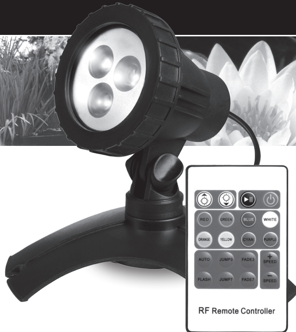
RF Remote Controller