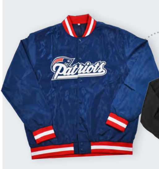
Custom Bomber Jacket

Looking for a unique statement piece at your next big event? Our bomber jackets and windbreakers are the perfect fit for your brand.