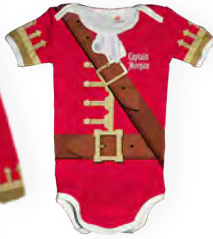
BON100 Sublimated Baby Bodysuit