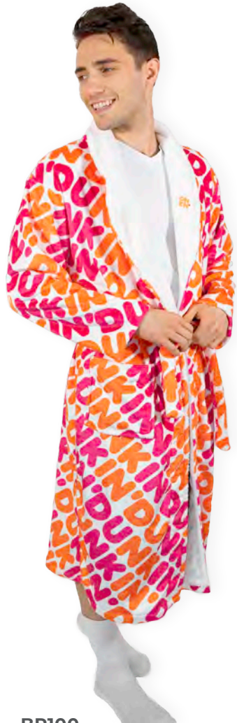
BR100 All Over Print Bathrobe