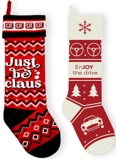
Custom Knit stockings