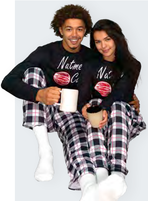
SLS100 Lounge Set