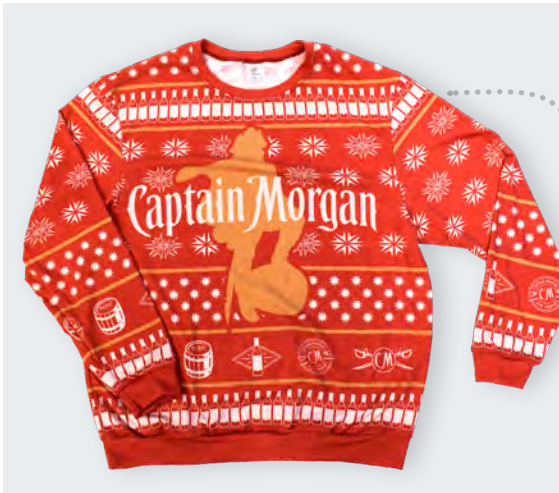
Sublimated to look like a knit holiday sweater, but super soft and cozy. Made domestically for your holiday procrastinating customers.