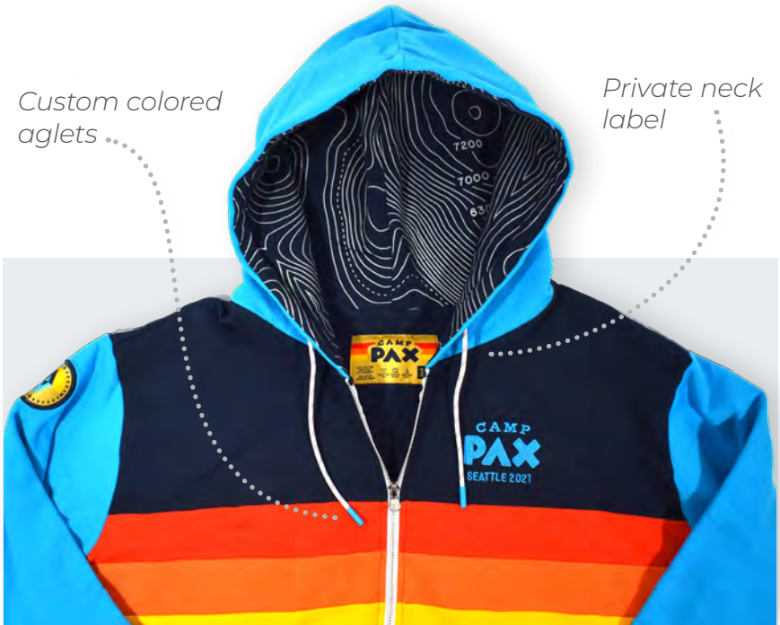
Private neck label