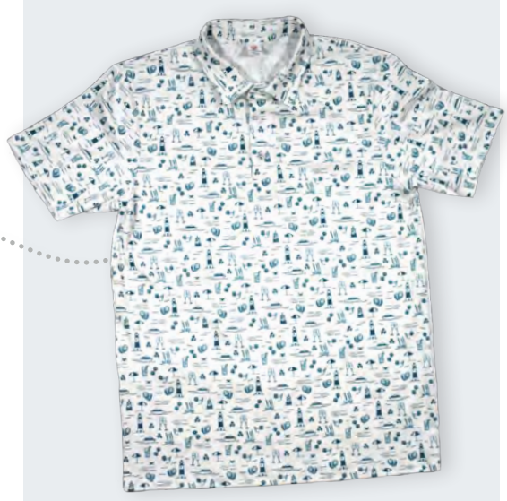
All over print organic cotton polo

Creativity and customization is at the core of what we do - let us help you find the perfect solution for those one-of-a-kind projects!