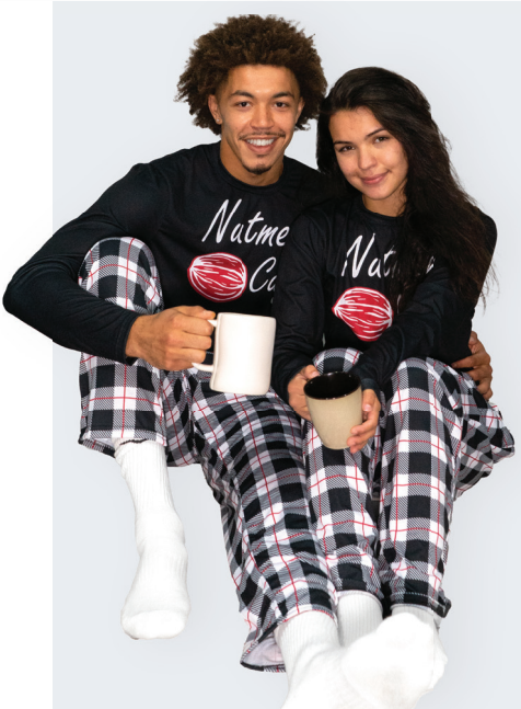
SLS100 Lounge Set