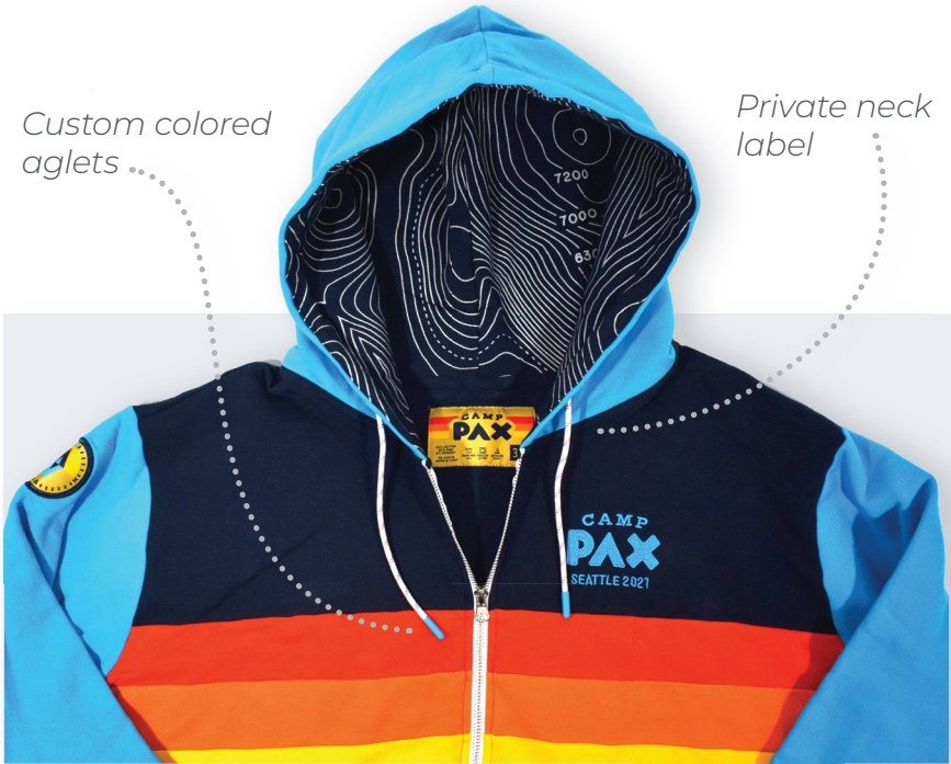
Custom colored aglets