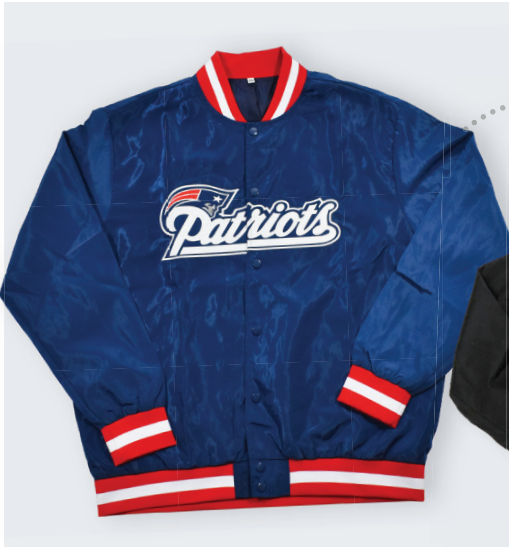
Custom Bomber Jacket

Looking for a unique statement piece at your next big event? Our bomber jackets and windbreakers are the perfect fit for your brand.