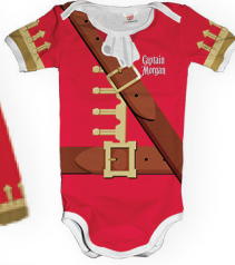
BON100 Sublimated Baby Bodysuit