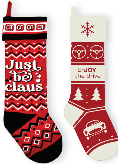
Custom Knit stockings