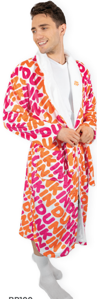
BR100 All Over Print Bathrobe