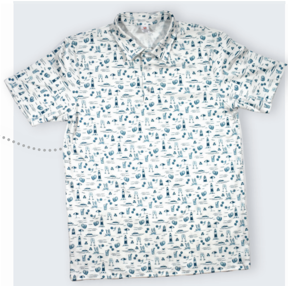
All over print organic cotton polo

Creativity and customization is at the core of what we do - let us help you find the perfect solution for those one-of-a-kind projects!