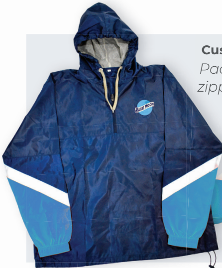
Custom Anorak Packs into front zippered pocket