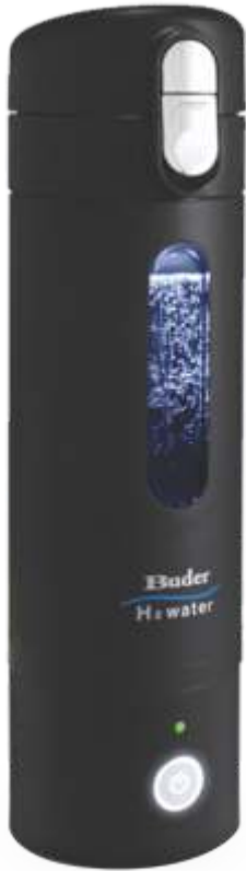
Buder Hydrogen Bottle HI-TA 13