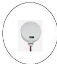
DIMMABLE MOTION SENSOR 120-277V