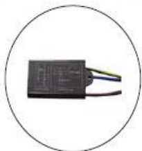
10KV SPD 120-277V