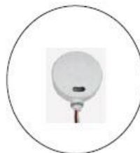
DIMMABLE MOTION SENSOR 120-277V