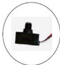
BUTTON STYLE PHOTOCELL 120-277V