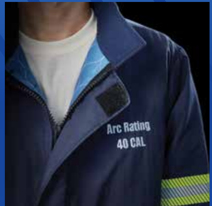
FR CONTROL 2.0™ ANTIMICROBIAL COLLAR