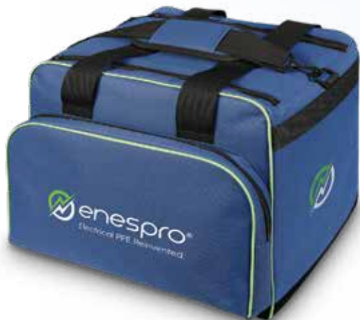
Small PPE Gear Bag

Head & hand PPE storage to accompany AR/FR daily wear programs