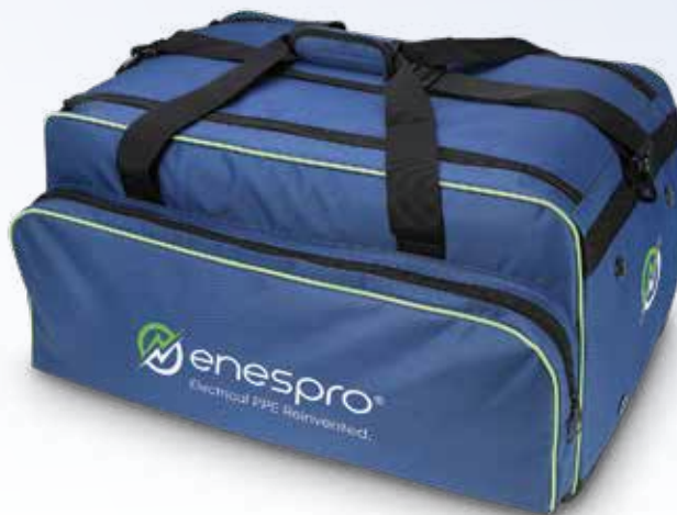
Large PPE Gear Bag

Head & hand PPE storage to accompany AR/FR daily wear programs