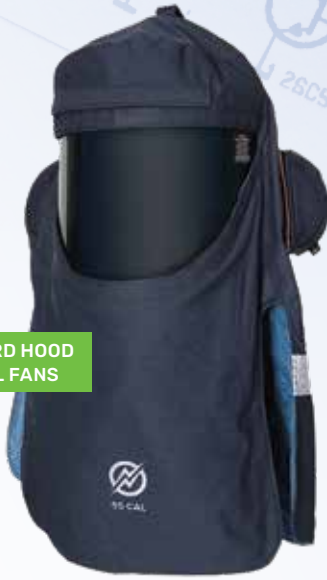
STANDARD HOOD W/DUAL FANS