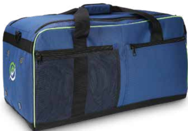
Exterior storage pockets for easy access