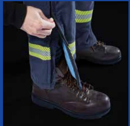
LEG ZIPPERS WITH NOMEX® TAPE