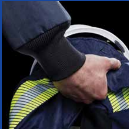
FR KNIT CUFFS