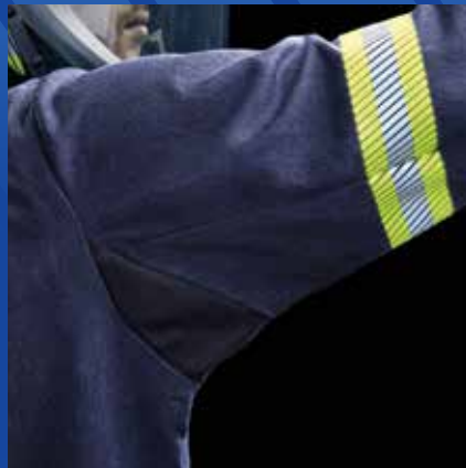
ACTIVECOOL VENTING™ UNDERARM SYSTEM