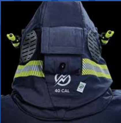
3M™ SCOTCHLITE™ FR REFLECTIVE TAPE

Built with comfort in mind, our line of AirLite™ electrical PPE is made in the USA and provides improved fit, flexibility and performance with every stitch.