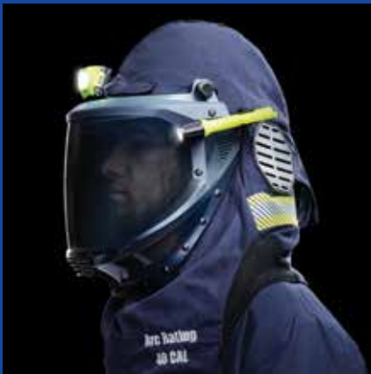
OPTISHIELD™ CLEAR GRAY-TINTED ANTI-FOG FACE SHIELD