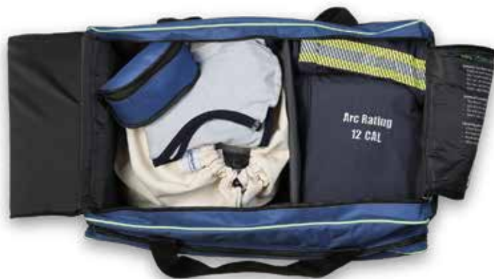
Padded box area to protect face shields and separate compartments for easy storage