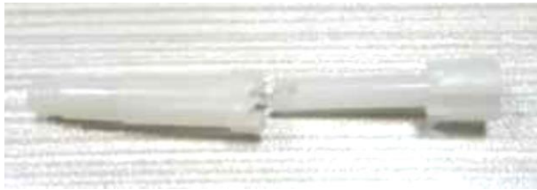
Step 1 Insert thinner piece into the piece with threaded end