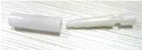
Step 2 Insert both pieces into the larger cylinder