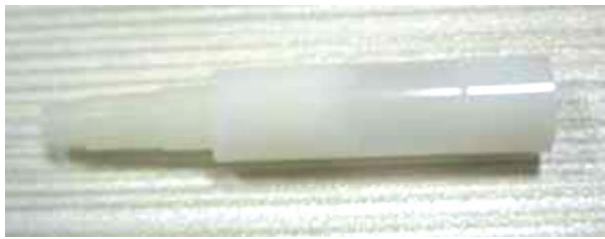
Step 3 When inserting make sure it extends all the way out the other side by sliding through the grooves in the cylinder.