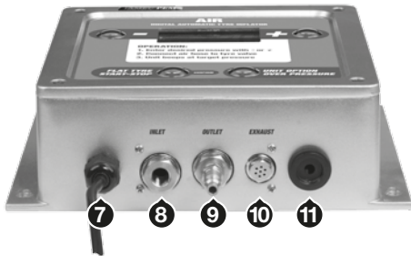
Fig. 2 Connections