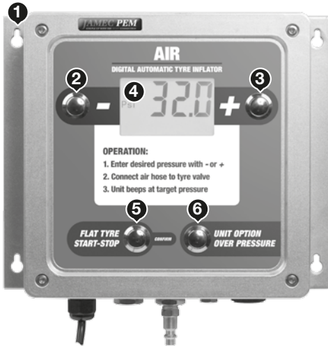
Fig. 1 Control panel