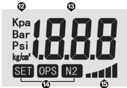
Fig. 3 Display