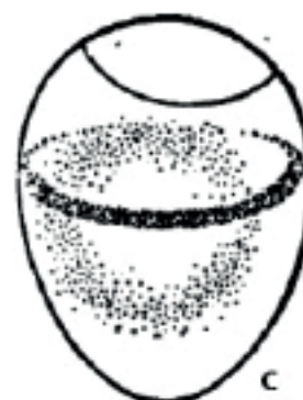
c) Dead embryo