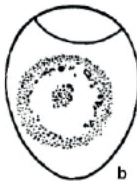
b) Infertile egg