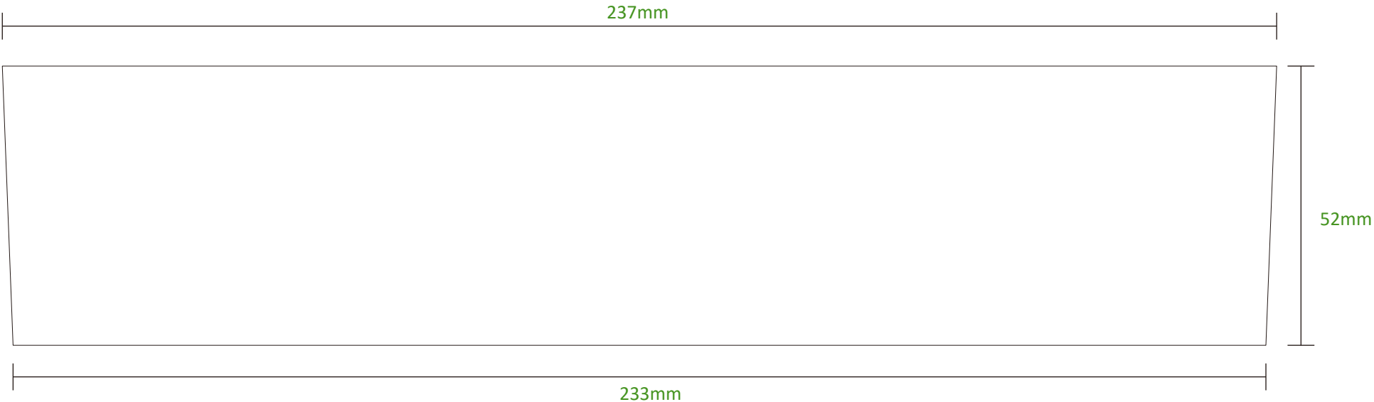
Full Wrap Label