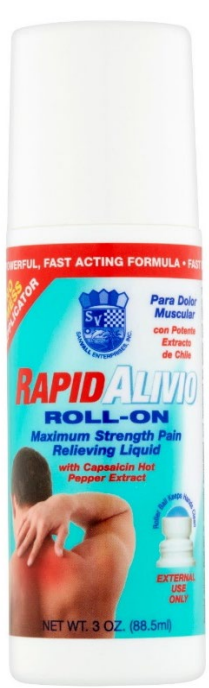
Recalled Sanvall Rapid Alivio Pain Relieving Roll-On – 3 fl. oz (88.5 mL)