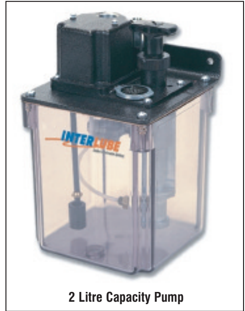
2 Litre Capacity Pump

Lubeplus 'E' has been manufactured using the highest engineering standards to give trouble free continuous and automatic operation.