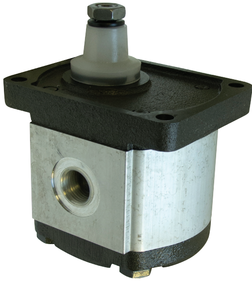
Ordering Chart - Clockwise

Aluminum fixed displacement gear pumps with cast iron end covers, standard 4 bolts European flange, 1:8 taper shaft and BSP tapped ports.