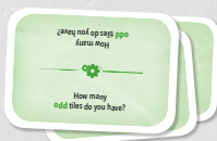
21 Question cards