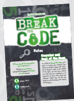
1 Rule booklet