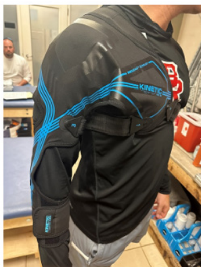
Figure 1: Kinetic Arm K1 Brace™.

As the patient began throwing and swinging, he noted that he felt fatigue in his shoulder more rapidly than prior to the injury. The patient also reported occasional pain in the anterior shoulder when throwing, though the intensity of the pain was significantly less than immediately following the injury. At this time, the athletic trainer recommended the use of an external dynamic arm stabilizer (The Kinetic Arm K1 Brace™, The Perfect Arm, LLC, Chamblee Georgia) seen in Figure 1. After wearing the arm stabilizer for one throwing and swinging session, the patient reported a decrease in feelings of fatigue and a decrease in episodes of pain when throwing. Given these results, the patient agreed to using the arm stabilizer throughout his rehabilitation process. During this time, the patient also expressed his desire to play in his team's upcoming post season competitions. Through consultation with the athletic trainer, team physician, and orthopedic surgeon, the patient provided informed consent to accelerate his return to participation to align with his goals. In this accelerated process, the patient was instructed to take the minimum number of throws and swings possible during practice to ensure he was prepared for participation in competitions. Throughout this process, the patient was told to report any increases in pain or prolonged soreness. Frequency of cupping therapy was increased to three times a week to increase blood flow and promote recovery.