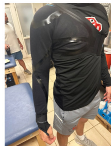
Figure 2: Kinetic Arm K2 Brace™.

Week 10+: After a month of rest from baseball specific activities, the patient resumed sport specific activities. Progression to returning to sport specific activity was prolonged, due to the patient being in his offseason. At this time, the patient obtained an updated model of the external dynamic arm stabilizer (The Kinetic Arm K2 Brace™, The Perfect Arm, LLC, Chamblee Georgia) seen in Figure 2. The patient initiated a maintenance rehabilitation program at this time, consisting of the exercises listed in Table 3 being performed three times a week. Sequential compression and cupping therapy were used when indicated due to post activity soreness. Aside from occasional soreness, the patient has been able to maintain an uncomplicated return to activity in preparation for his upcoming season.