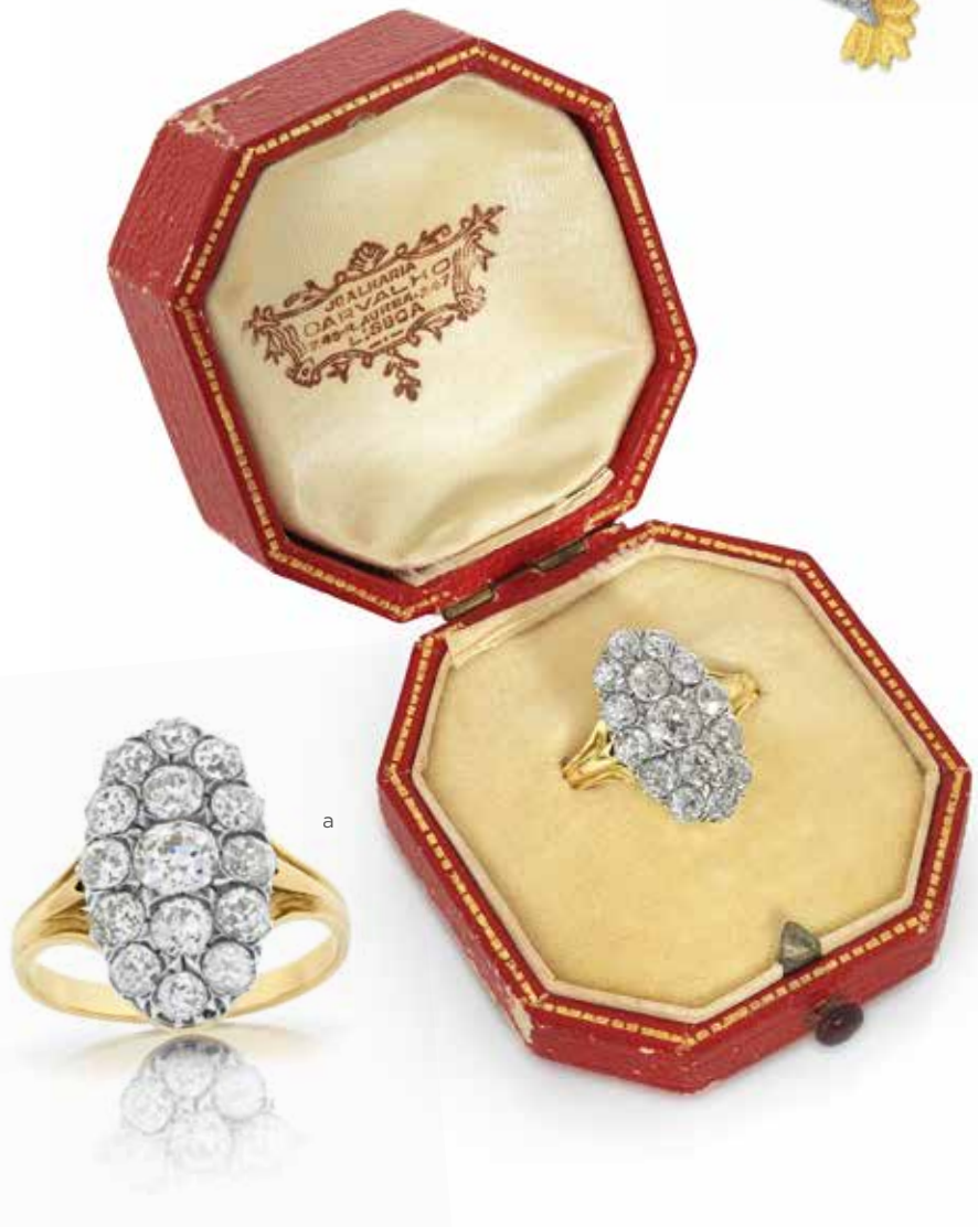
a Antique Diamond Cluster Ring (boxed) $19,500 b Diamond set Hummingbird Brooch $2,950