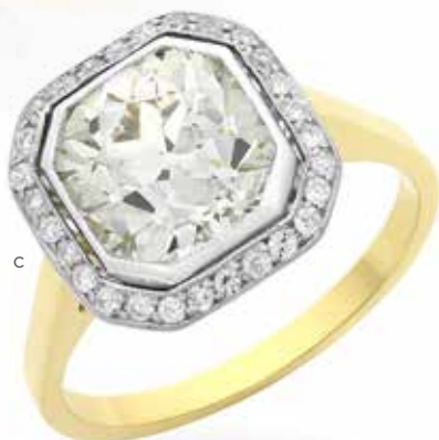
a 5.27ct Cushion Cut Diamond Ring POA b Old European Cut Cluster Ring $26,500 c 3.20ct Old Cut Diamond Ring POA