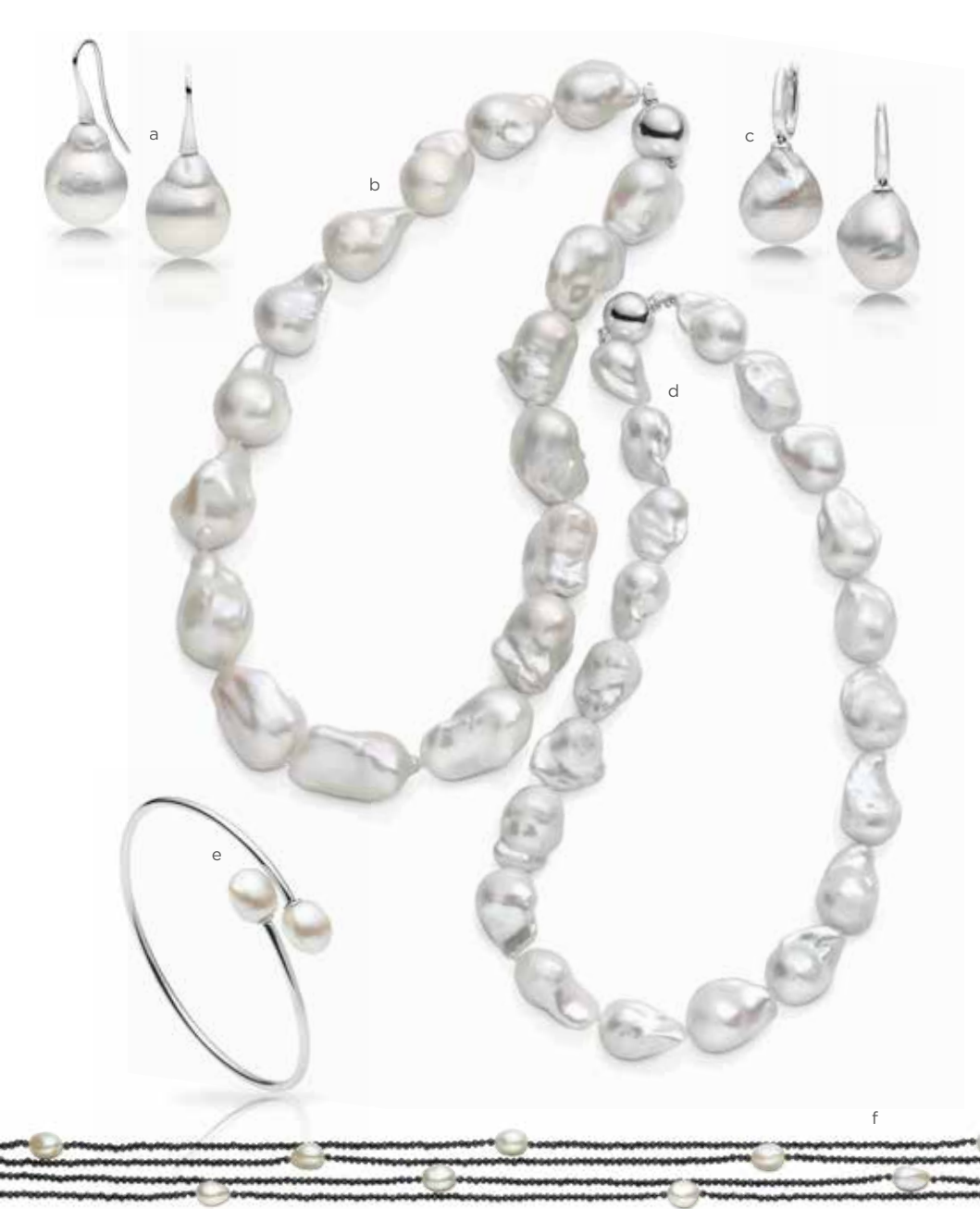
a Baroque Freshwater Pearl Hooks $800 b 13-17mm Baroque Freshwater Pearl Strand $1,200 c Baroque Freshwater Pearl Huggies $995 d 12-15mm Baroque Freshwater Pearl Strand $800 e Double Freshwater Pearl Cuff $250 f Freshwater Pearl & Spinel Rope Necklace $400