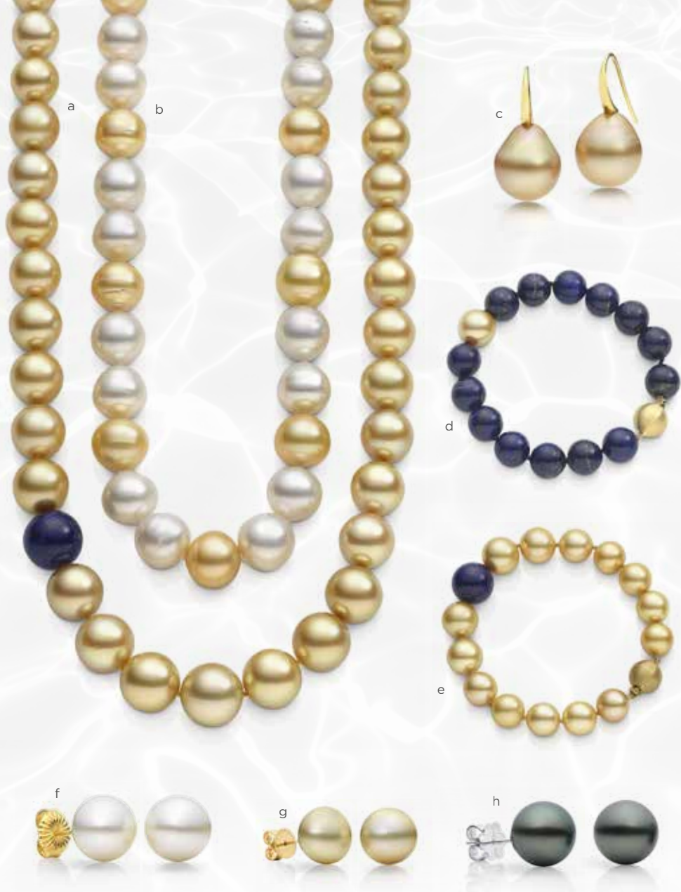
a Gold South Sea Pearl Strand with Lapis Lazuli $28,500 b Gold & White South Sea Pearl Strand $5,200 c 16-17mm Gold South Sea Pearl Hooks $4,800 d Lapis Lazuli & Gold South Sea Pearl Bracelet $2,200 e Gold South Sea Pearl & Lapis Lazuli Bracelet $5,000 f 10mm White South Sea Pearl Studs $2,100 g Gold South Sea Pearl Studs $1,100 h Tahitian South Sea Pearl Studs $1,600