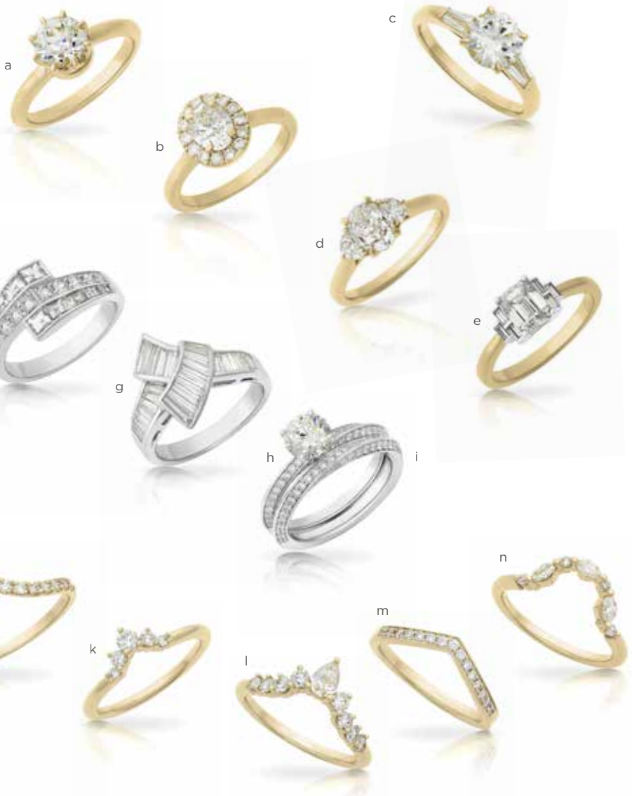
a 1.25ct Old European Cut Solitaire $15,800 b Oval Diamond Cluster Ring $17,500 c 1.33ct Diamond Solitaire Ring $14,500 d Oval Diamond Ring $16,500 e Emerald Cut Diamond Ring $18,500 f Diamond Cross Over Ring $9,800 g Baguette Cut Cross Over Ring $8,800 h 1.00ct F VS2 Diamond Solitaire $19,800 i Diamond Twist Band $2,685 j V-Shaped Diamond Band $2,190 k Five Diamond Band $2,880 l Diamond Band with Pear Cut $3,950 m Grain Set Diamond Band $2,800 n Curved Diamond Band $2,850