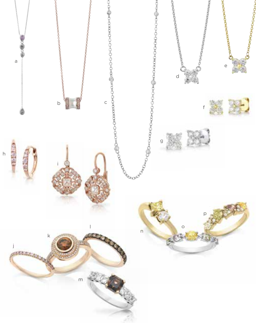
a Pink Diamond Necklace $8,950 b Pink Argyle Diamond Pendant $6,500 c Scattered Diamond Chain $2,200 d Diamond Flower Necklet $1,515 e Diamond Flower Necklet $1,515 f Diamond Flower Studs $2,055 g Diamond Flower Studs $2,055 h Pink Argyle Diamond Huggies $4,950 i Asscher Cut Diamond Earrings $7,250 j Pink Argyle Diamond Band $5,450 k Orangi Brown Diamond Ring $14,500 l Champagne Diamond Band $2,200 m Asscher Cut Diamond Ring $9,900 n Yellow & White Diamond Ring $9,900 o Oval Coloured Diamond Ring $13,750 p Multi Coloured Diamond Band $13,500