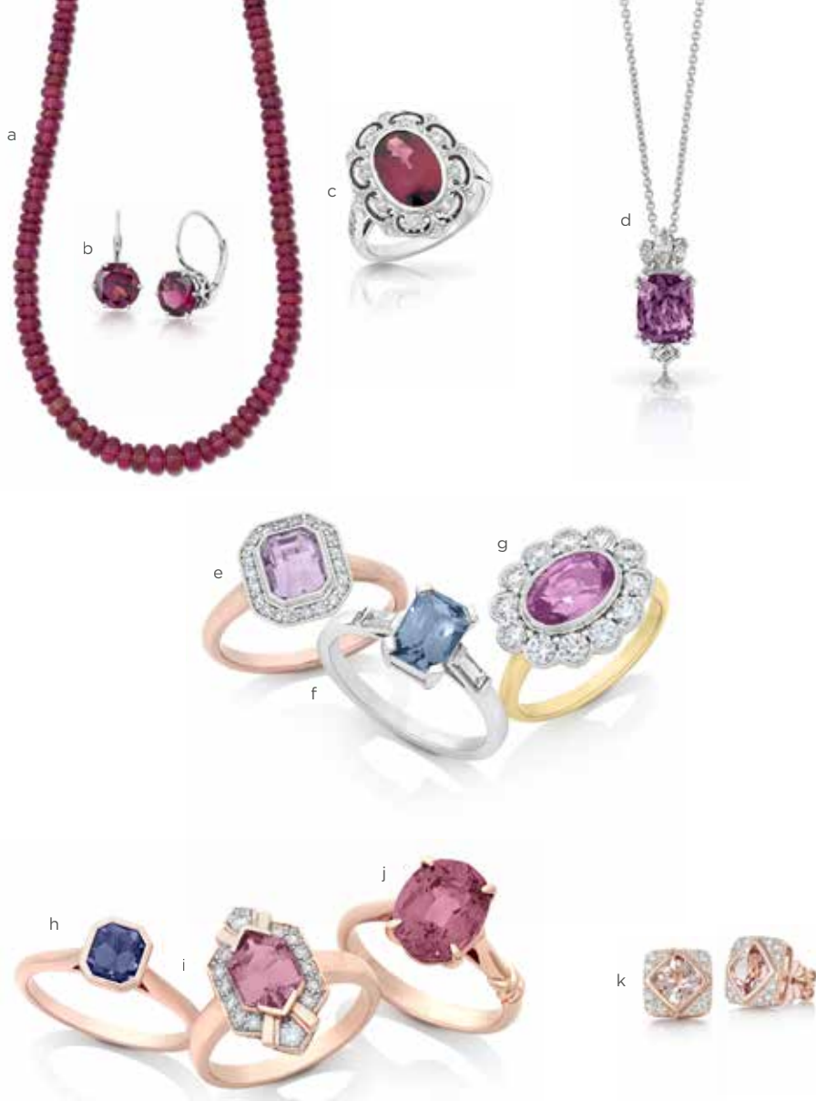
a Tourmaline Beads $2,450 b Rhodolite Garnet Earrings $2,550 c Rhodolite Garnet Ring $5,250 d Purple Sapphire & Diamond Pendant (chain additional) $4,950 e Purple Spinel Ring $4,950 f Purple-Grey Spinel Ring $5,200 g Unheated Pink Sapphire Cluster Ring $9,250 h Violet Spinel Ring $3,850 i Pink Tourmaline Ring $3,850 j Unheated Pink Spinel Ring $18,500 k Morganite & Diamond Studs $4,250