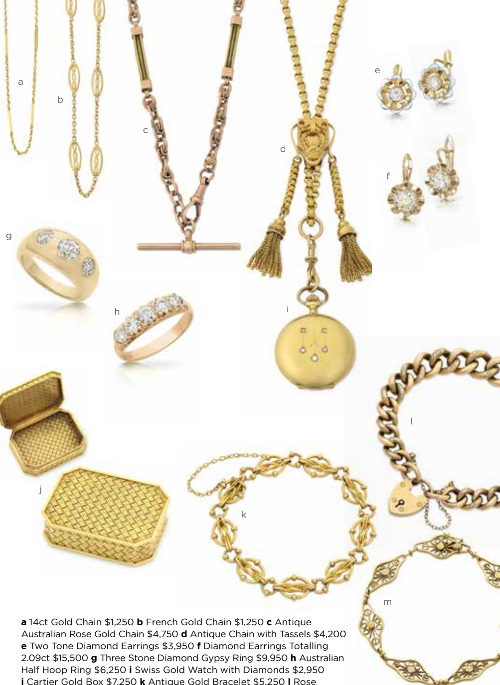
a 14ct Gold Chain $1,250 b French Gold Chain $1,250 c Antique Australian Rose Gold Chain $4,750 d Antique Chain with Tassels $4,200 e Two Tone Diamond Earrings $3,950 f Diamond Earrings Totalling 2.09ct $15,500 g Three Stone Diamond Gypsy Ring $9,950 h Australian Half Hoop Ring $6,250 i Swiss Gold Watch with Diamonds $2,950 j Cartier Gold Box $7,250 k Antique Gold Bracelet $5,250 l Rose Gold Padlock Bracelet $1,950 m Antique French Bracelet $3,250