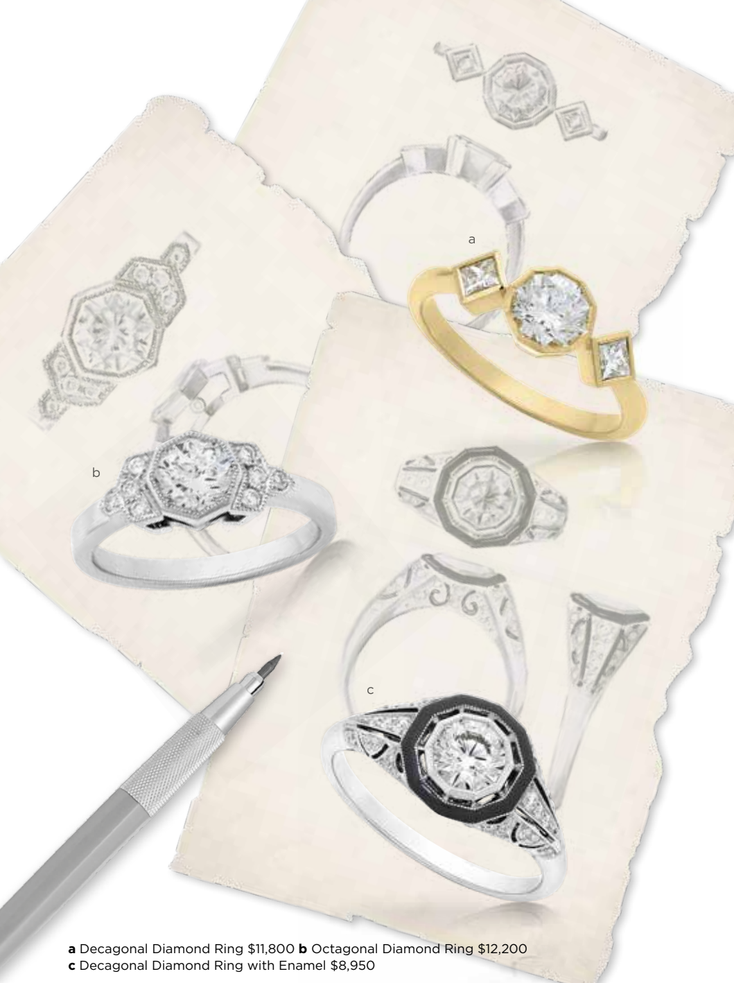
a Decagonal Diamond Ring $11,800 b Octagonal Diamond Ring $12,200 c Decagonal Diamond Ring with Enamel $8,950