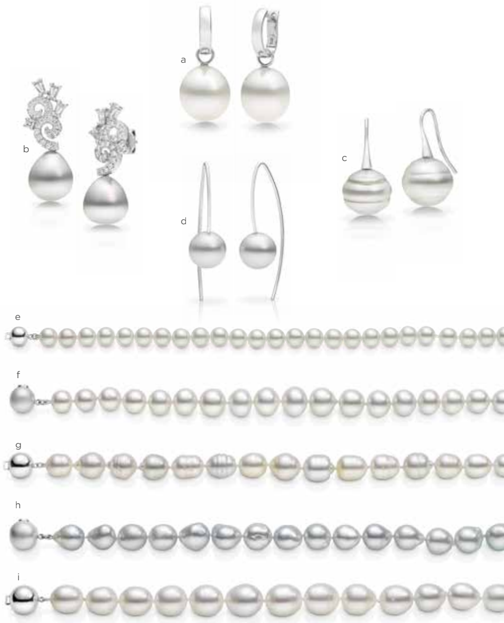
a 13mm South Sea Pearl Huggie Earrings $3,500 b South Sea Pearl & Diamond Earrings $5,400 c Circlé South Sea Pearl Earrings $1,850 d South Sea Pearl Hook Earrings $2,950 e 7mm South Sea Pearl Bracelet $1,650 f Button White South Sea Pearl Bracelet $2,100 g Baroque South Sea Pearl Bracelet $1,700 h Silver Baroque South Sea Pearl Bracelet $1,900 i Drop Shaped South Sea Pearl Bracelet $2,850