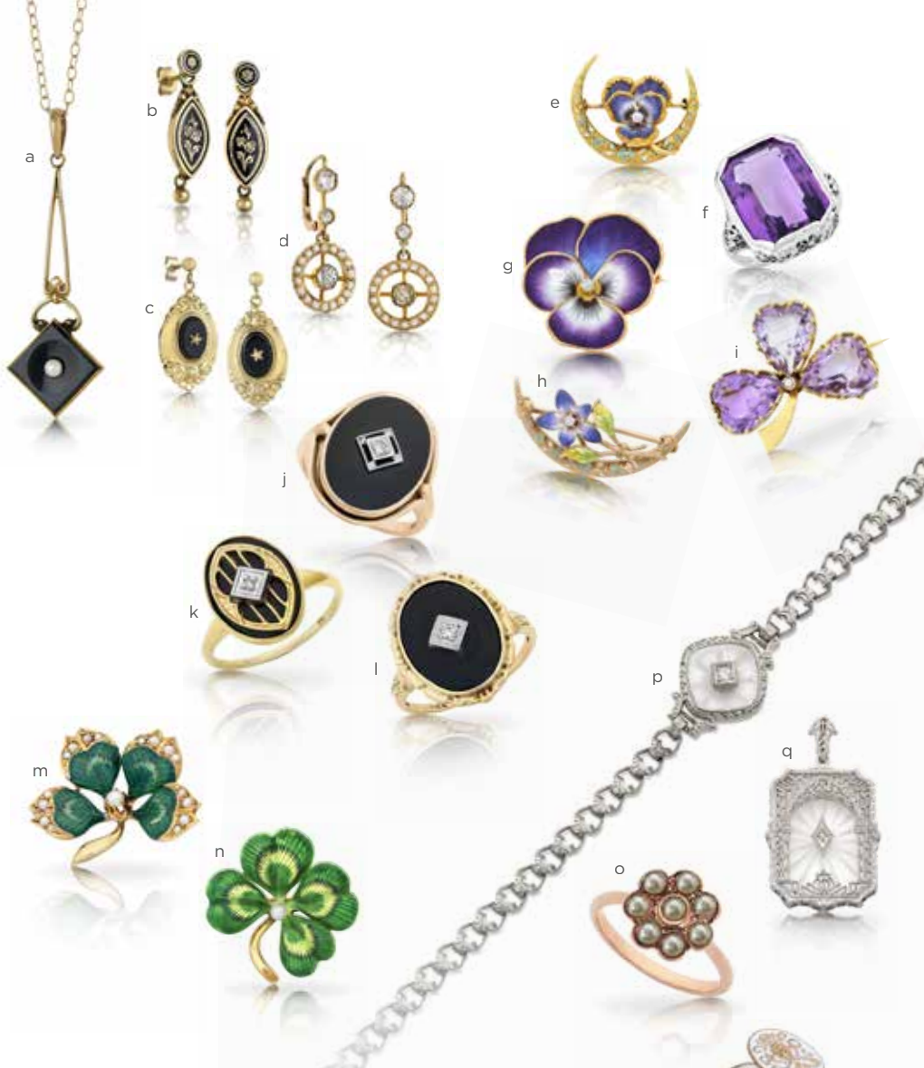
a Onyx & Seed Pearl Pendant $695 b Antique Drop Earrings $1,250 c Antique Onyx Earrings $795 d Antique Diamond Earrings $4,450 e Pansy Brooch with Diamond $1,450 f Amethyst Filigree Ring $2,950 g Pansy Brooch/Pendant $2,950 h Floral Enamel Brooch $990 i Antique Australian Amethyst Brooch $950 j Onyx & Diamond Ring $1,350 k Onyx & Diamond Ring $1,250 l Onyx & Diamond Ring $1,450 m Four Leaf Clover Pendant $1,450 n Four Leaf Clover Brooch $1,650 o Antique Seed Pearl Ring $1,250 p Rock Crystal Bracelet with Diamond $1,450 q Rock Crystal Pendant $1,550 r Oval Enamel Cufflinks $825