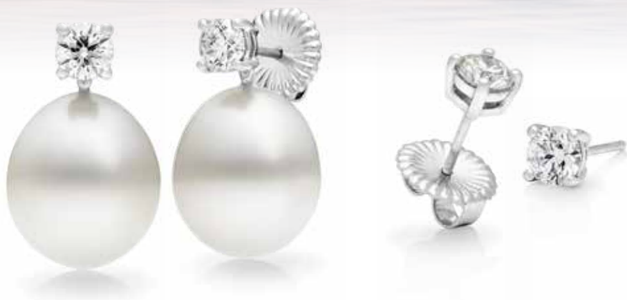
Australian South Sea Pearl Earrings with 1.00ct Total Diamonds $14,500