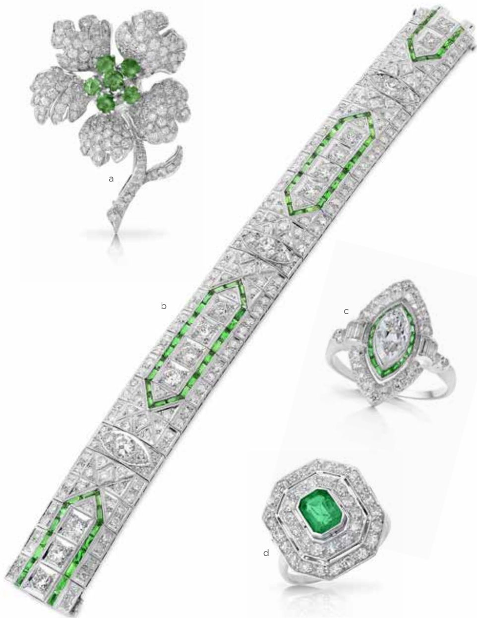
a Emerald & Diamond Flower Brooch $15,500 b Art Deco Diamond Bracelet $28,500 c Marquise Diamond Ring circa 1920 $9,900 d Art Deco Emerald & Diamond Ring $8,800