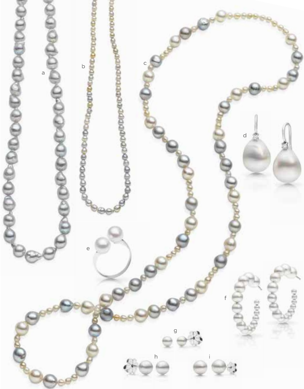
a Silver Baroque Akoya Pearl Strand $550 b 3-4mm Multi Coloured Akoya Pearl Strand $450 c Matinee Silver & White Akoya Pearl Strand $700 d Freshwater Pearl & Diamond Hooks $1,300 e Double Freshwater Pearl Ring $900 f Akoya Pearl Hoop Earrings $1,980 g 4-4.5mm Akoya Pearl Studs $500 h 5.5-6mm Akoya Pearl Studs $700 i 8-8.5mm Akoya Pearl Studs $900