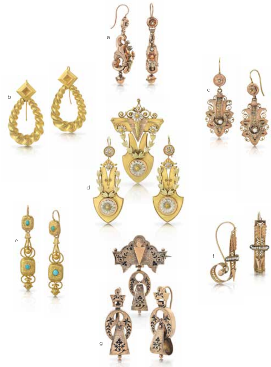
a Ornate Antique Earrings (boxed) $7,950 b Large Gold Twist Earrings $3,950 c Victorian Gold Earrings $5,850 d Victorian Earring & Pendant Suite $6,250 e French Earrings with Turquoise $4,950 f Antique Gold Arrow Earrings $1,950 g Demi-Parure (Brooch & Earrings) circa 1880 $3,350