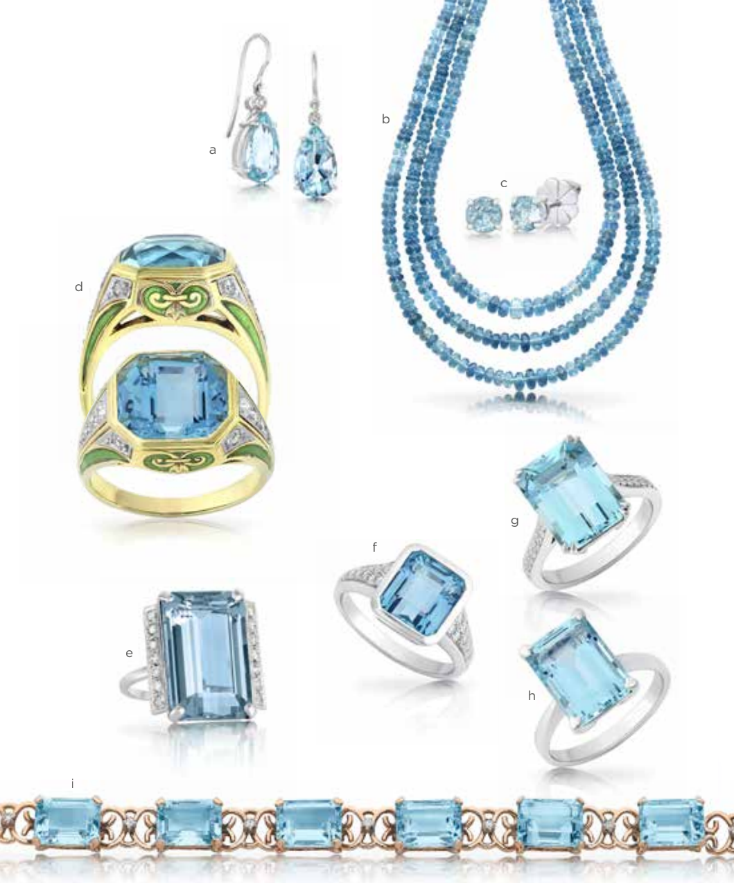
a Aquamarine Drop Earrings $4,950 b Triple Strand Aquamarine Beads $3,300 c Aquamarine Studs $980 d Art Nouveau Aquamarine Ring $15,500 e Aquamarine Cocktail Ring $16,750 f Aquamarine & Diamond Ring $7,500 g 6.30ct Aquamarine Ring $9,850 h Emerald Cut Aquamarine Ring $8,800 i Antique Aquamarine Bracelet $28,500