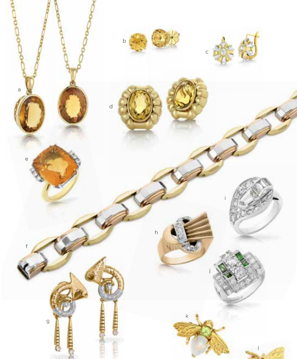
a Golden Beryl Pendant (chain additional) $6,600 b Golden Beryl Studs $1,975 c Retro Diamond Earrings $3,950 d Pair of Citrine Earrings $4,500 e Citrine & Diamond Ring $4,850 f Gold Retro Bracelet $4,500 g Retro Earrings with Diamonds $4,950 h Retro Gold Ring with Diamonds $3,750 i Retro Diamond Ring $14,500 j Diamond & Emerald Ring $6,850 k Opal Insect Brooch $2,250 l Citrine Insect Brooch $2,750