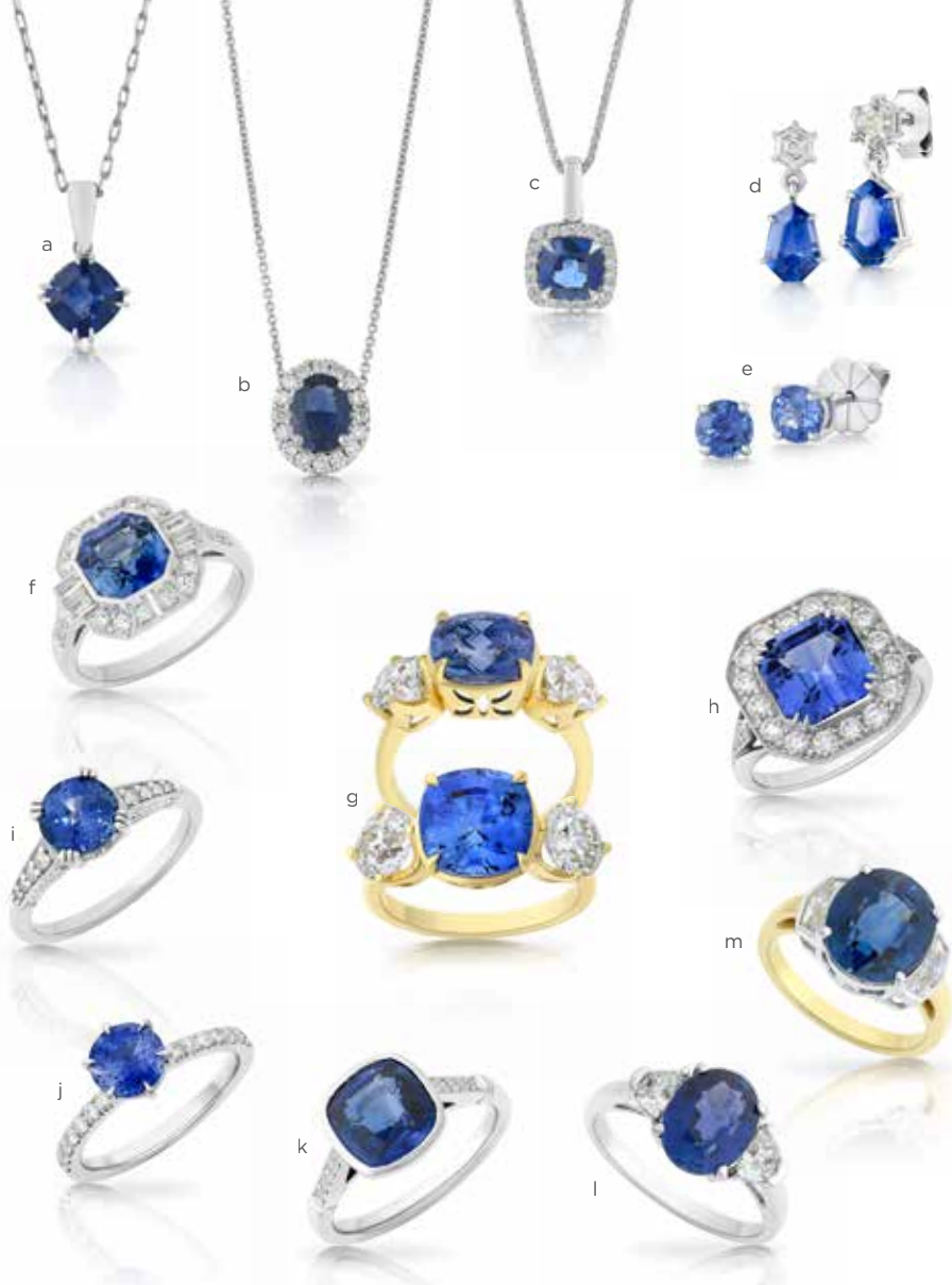
a Madagascan Sapphire Pendant (chain additional) $6,850 b Sapphire & Diamond Cluster Pendant $4,850 c Sapphire & Diamond Pendant (chain additional) $4,250 d Sapphire & Diamond Earrings $6,800 e Sapphire Stud Earrings $1,975 f Sri Lankan Sapphire & Diamond Ring $15,500 g Sapphire & Diamond Three Stone Ring $38,500 h Sapphire & Diamond Ring in Platinum $27,500 i Sri Lankan Sapphire & Diamond Ring $8,750 j Sapphire & Diamond Solitaire $8,800 k Cushion Cut Sri Lankan Sapphire Ring $17,500 l 3.08ct Sri Lankan Sapphire & Diamond Ring $17,500 m Unheated 7.69ct Ethiopian Sapphire Ring $33,000