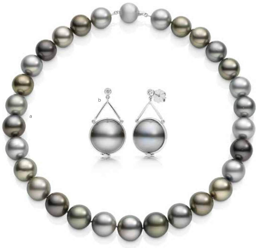
a 15-17mm Round Shaded Tahitian Pearl Strand $45,000 b 16mm Circled Tahitian Pearl Earrings $5,500