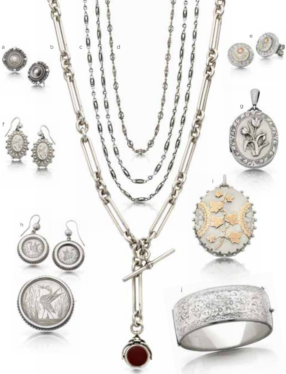
a Victorian Silver Earrings $475 b Antique Silver Chain with Spinner $1,250 c Victorian Silver Chain $1,250 d Antique Silver Chain $1,450 e Antique Silver Studs $695 f Antique Silver Drop Earrings $680 g Antique Silver Tulip Locket $650 h Victorian Silver Brooch & Earrings (boxed) $1,950 i Silver & Rose Gold Locket $750 j Sterling Silver Bangle $950