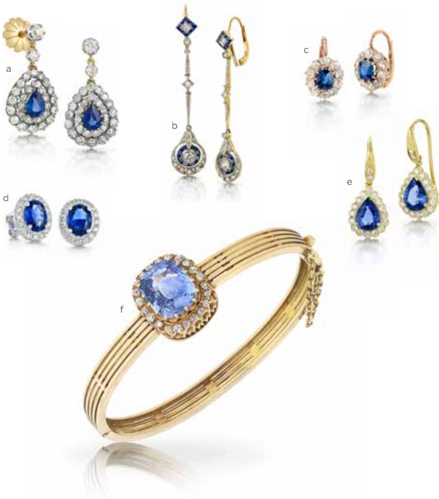
a Antique Sapphire & Diamond Cluster Earrings $19,500 b Diamond & Sapphire Drop Earrings $3,950 c Antique Sapphire & Diamond Earrings $7,650 d Sapphire & Diamond Cluster Stud Earrings $12,500 e Sapphire & Diamond Drop Earrings $9,800 f Unheated Sri Lankan Sapphire Bangle POA g Sapphire & Diamond Half Hoop Ring $3,450 h Diamond & Sapphire Half Hoop Ring $5,850 i Antique Australian Sapphire & Diamond Ring $3,650