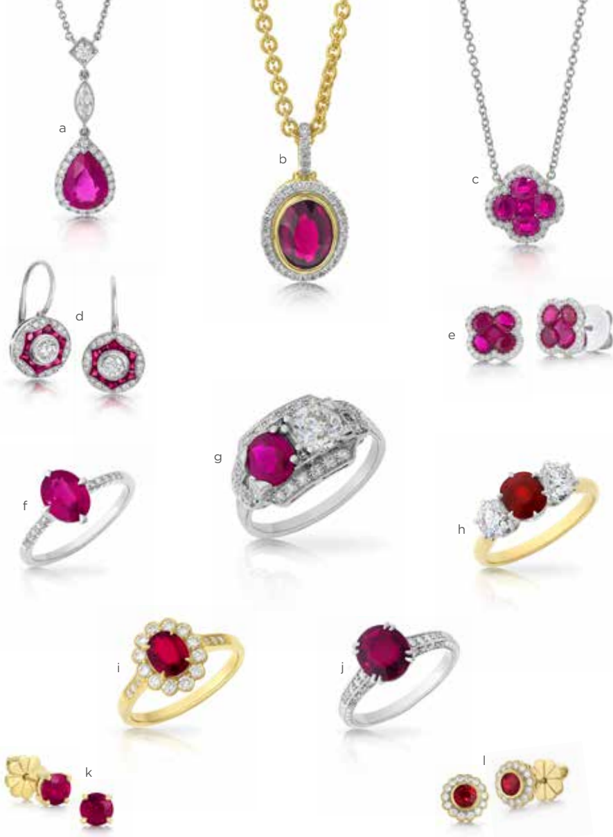
a Ruby & Diamond Necklace $14,500 b Unheated 2.22ct Ruby & Diamond Pendant (chain additional) $27,500 c Ruby & Diamond Pendant $2,750 d Diamond & Ruby Earrings $5,250 e Ruby & Diamond Stud Earrings $4,750 f Burmese Ruby Ring $12,500 g Ruby & Diamond Toi et Moi Ring $16,500 h Ruby & Diamond Three Stone Ring $24,500 i Unheated Ruby Cluster Ring $12,800 j Engraved Ruby & Diamond Ring $17,500 k Ruby Stud Earrings $3,500 l Ruby & Diamond Stud Earrings $4,250