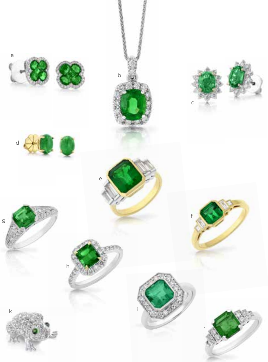
a Emerald & Diamond Clover Earrings $4,750 b Emerald & Diamond Cluster Pendant (chain additional) $12,500 c Emerald & Diamond Clusters $12,500 d Cabochon Emerald Studs $3,750 e 4.08ct Emerald & Diamond Ring $33,750 f Emerald & Diamond Ring $6,850 g French Platinum, Emerald & Diamond Ring $12,500 h Colombian Emerald & Diamond Ring $16,500 i Emerald & Diamond Cluster Ring $14,300 j Zambian Emerald & Diamond Ring $9,800 k Diamond set Frog Brooch $5,500