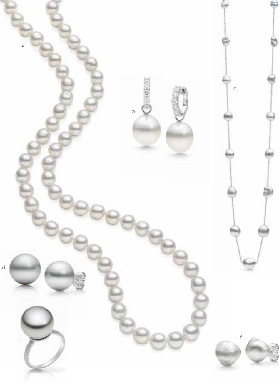
a Opera South Sea Pearl Strand $8,500 b South Sea Pearls on Diamond Huggies $8,850 c Scattered South Sea Keshi Pearl Chain $4,500 d 16mm Silver Tahitian Pearl Studs $4,900 e 14mm Silver Tahitian Pearl Ring $3,800 f Keshi South Sea Pearl Studs $2,200