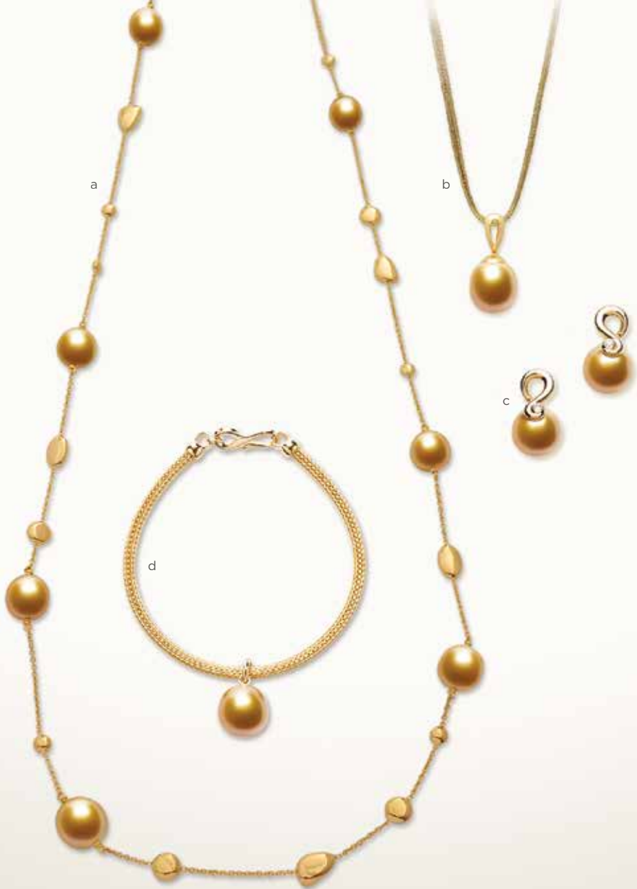
a Scattered Gold South Sea Pearl Chain $9,900 b 11mm Gold South Sea Pearl Pendant (chain additional) $1,250 c Gold South Sea Pearl Earrings $6,900 d Gold South Sea Pearl Mesh Bracelet $3,800