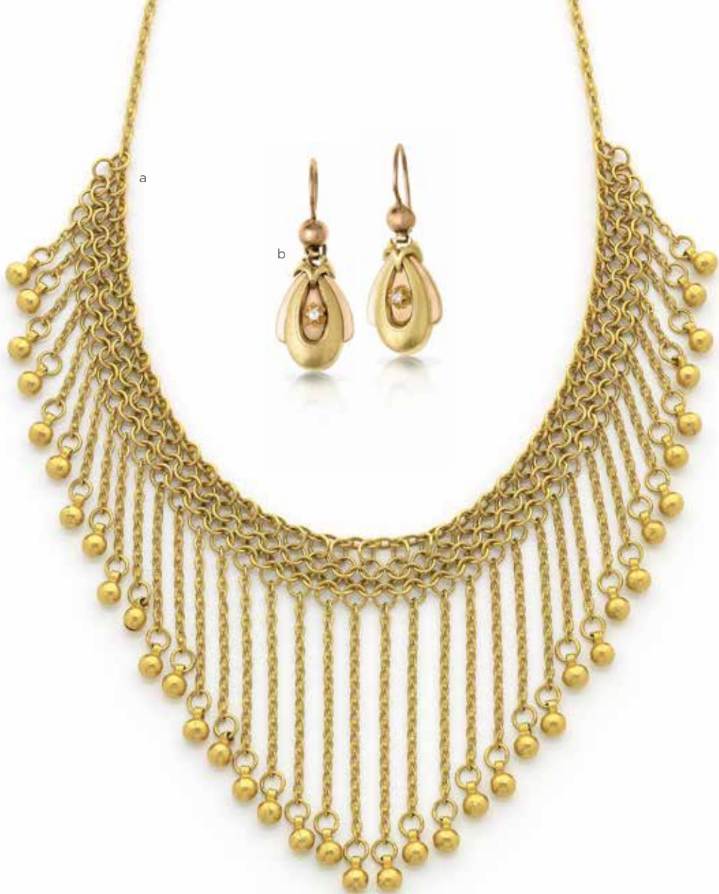
a 22ct Gold Fringe Necklet $9,500 b Gold Drop Earrings circa 1880 $2,650