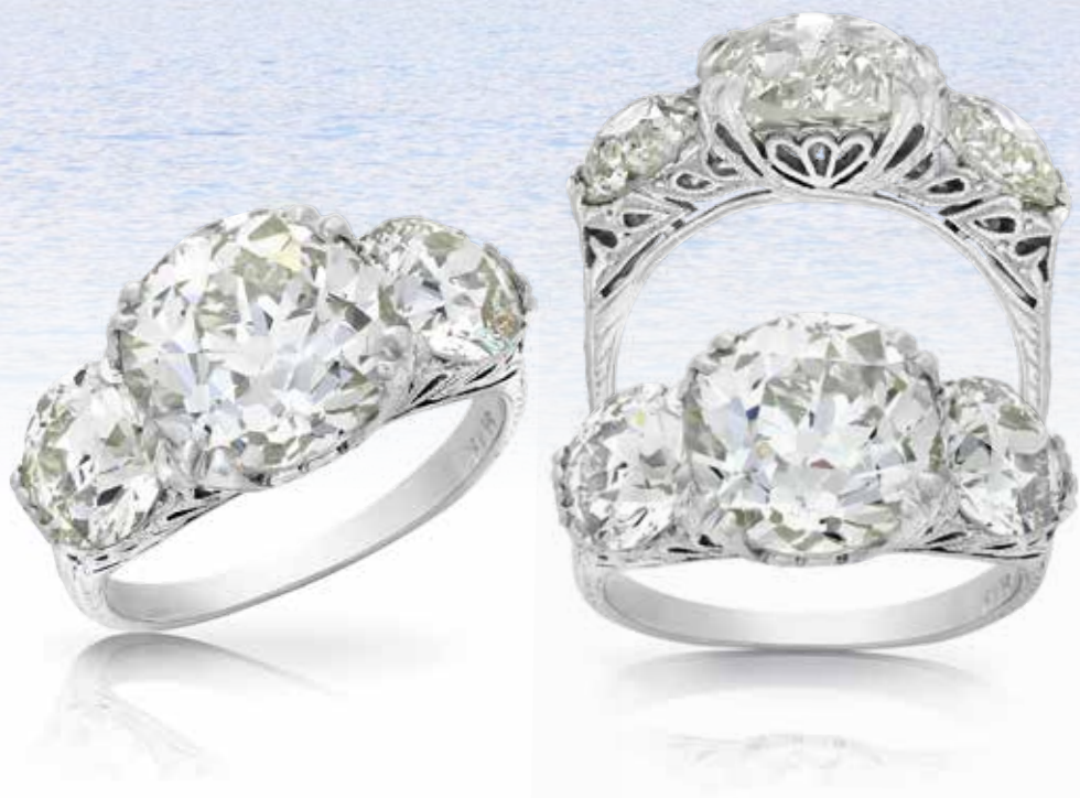
Three Stone Old European Cut Diamond Ring Totalling 6.19ct POA