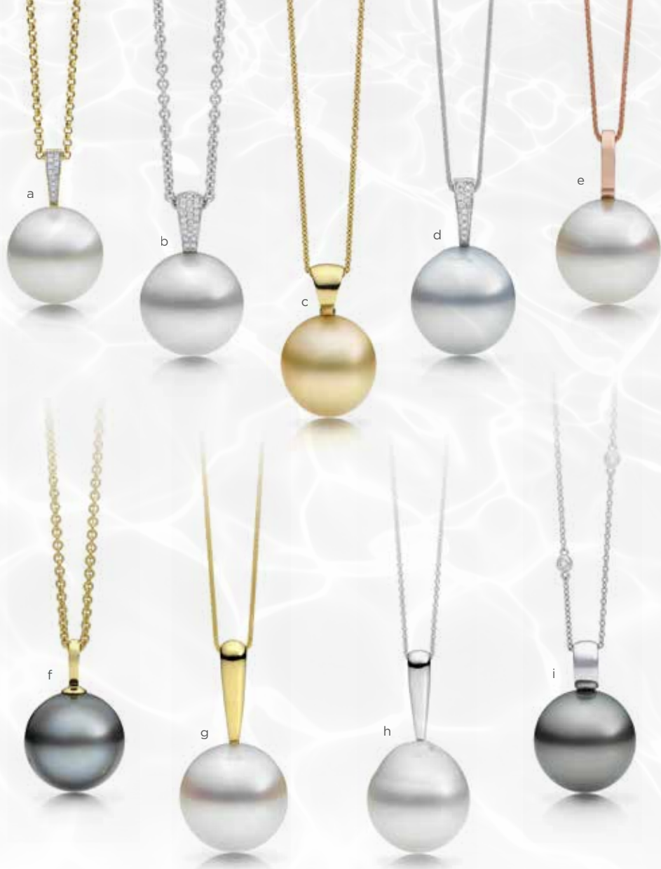
a 18mm South Sea Pearl & Diamond Enhancer $8,800 b 19mm South Sea Pearl & Diamond Pendant $9,900 c 14-15mm Gold South Sea Pearl Pendant $3,800 d 17mm South Sea Pearl & Diamond Enhancer $7,900 e 16.5mm South Sea Pearl Pendant $5,750 f 21mm Tahitian Pearl Pendant $3,500 g 16.8mm South Sea Pearl Pendant $5,900 h 18mm Baroque South Sea Pearl Pendant $4,500 i 16mm Silver Grey Tahitian Pearl Pendant $4,500

Please note: Prices shown are for pendants only, all chains additional.