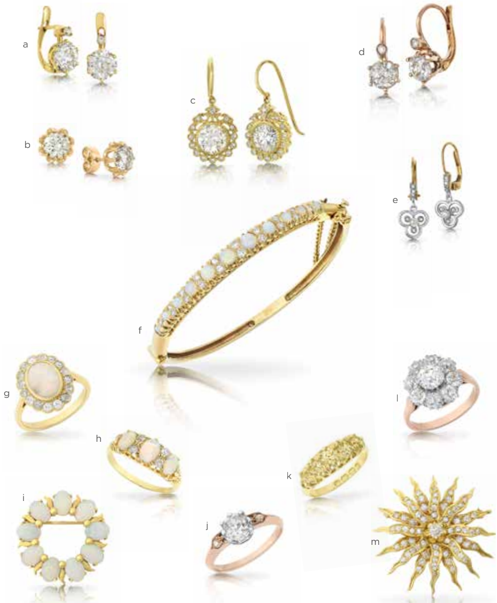
a Old European Cut Diamond Earrings $29,800 b Old Cut Diamond Studs $15,500 c Old Cut Diamond Cluster Earrings $27,500 d Antique Diamond Earrings $8,800 e Antique Drop Earrings $2,450 f Opal & Diamond Bangle $5,800 g Opal & Diamond Cluster Ring $5,500 h Antique Opal & Diamond Ring $2,950 i Opal Circlet Brooch $3,800 j 1.01ct Cushion Cut Diamond Ring $12,500 k Antique Half Hoop Diamond Ring (boxed) $5,500 l Diamond Cluster Ring $18,500 m Diamond Brooch circa 1900 $6,500