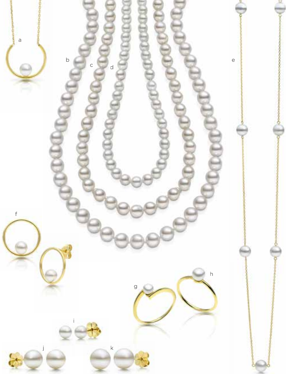
a Freshwater Pearl Crescent Necklace $1,100 b 8-8.5mm Round Akoya Pearl Strand $5,500 c Baroque Akoya Pearl Strand $950 d 6-6.5mm Round Akoya Pearl Strand $1,950 e Scattered Akoya Pearl Opera Chain $1,950 f Freshwater Pearl Circle Earrings $750 g 4mm Freshwater Pearl Ring $550 h 5mm Freshwater Pearl Ring $600 i 5-5.5mm Akoya Pearl Studs $650 j 7.5-8mm Akoya Pearl Studs $850 k 8-8.5mm Akoya Pearl Studs $900