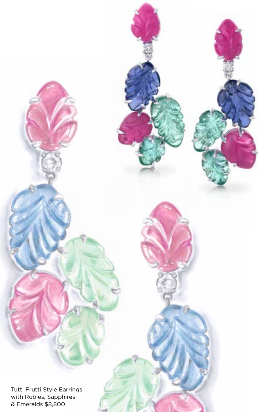
Tutti Frutti Style Earrings with Rubies, Sapphires & Emeralds $8,800