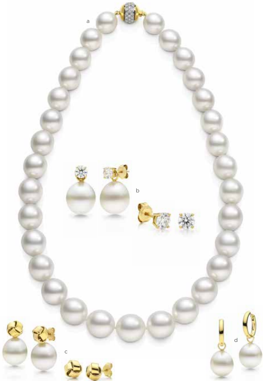
a Australian South Sea Pearl Strand with Diamond Clasp $38,800 b Australian South Sea Pearl Earrings with 1.20ct Total Diamonds $14,000 c South Sea Pearl Knot Earrings $3,950 d 13mm South Sea Pearl Huggie Earrings $6,500