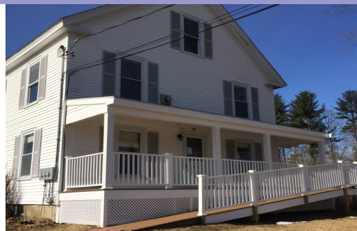
FNE at Redberry Farm 38 Plumer Road, Epping, NH 03042 603-734-5383