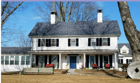
FNE at Rosewald Farm 213 Center Road, Hillsborough, NH 03244