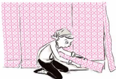
FIG 5 Trim away excess paper.

Trim away any excess using a very sharp cutter or blade. Use this method around windows, door and moldings.