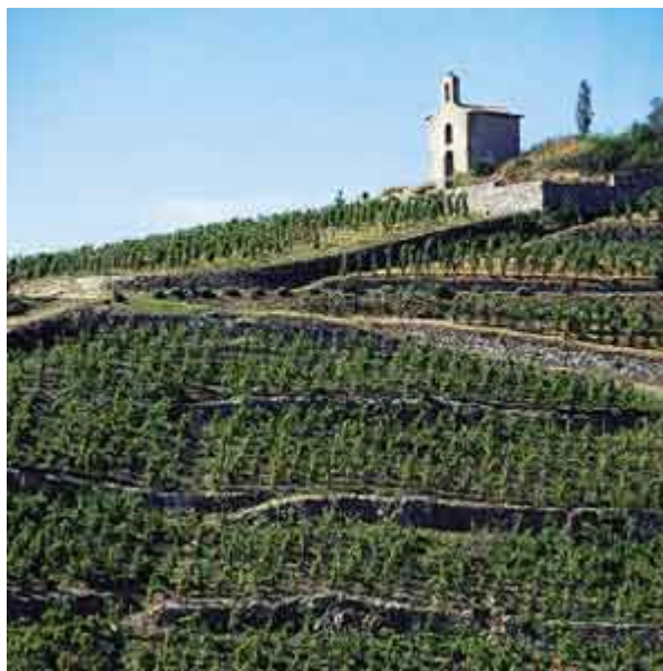
La Chapelle, Hermitage

£/cs in Bond Drinking Dates Hermitage La Chapelle £550.00 2008 – 2020+ “Deep, saturated ruby. Pungent, spicy aromas of cassis, blackberry, leather, tobacco and green Chartreuse. Very rich, dense and chewy, offering a powerful dark fruit and wild game character complicated by tobacco and licorice root. As sweet and lush as this is, it's solidly framed by powerful tannins. This has serious extract and impressive muscle, finishing on a note of hot asphalt. 92-94 points.” Stephen Tanzer’s International Wine Cellar, Jan/Feb 06