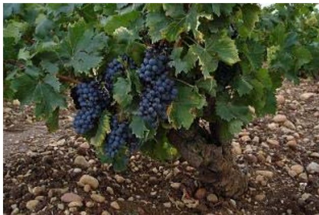
Old vine Grenache in Chateaneuf du Pape

Châteauneuf du Pape Cuvée Félix (limited) £125.00 per 6 2008 – 2020+ Jean-Paul's Cuvée Félix is produced from a selection of vines from his best parcels whose yields were a mere 20 hl/ha. The palate is powerful, dense and notably wild with notes of leather and herbes de provence due to the higher percentage of Mourvèdre. Complex yet elegant. A wonderful old styled Châteauneuf du Pape.