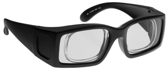
#55 Wraparound w/Insert