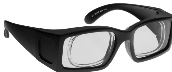
#55 Wraparound w/Insert