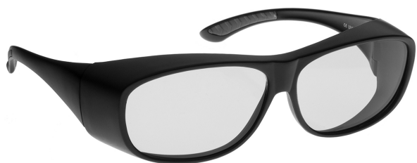
#51 Medium / #53 Large Universal