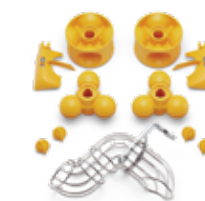
Kit S Squeezing Kit (45 - 67 mm)