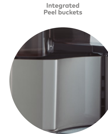
Integrated Peel buckets