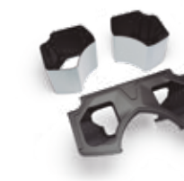
Countertop Kit Orange Silver Graphite