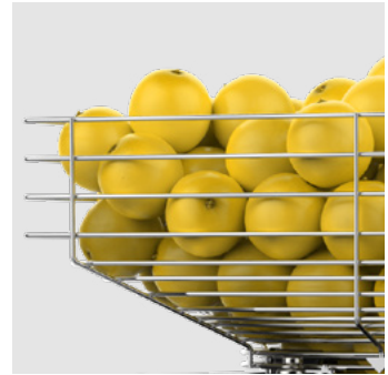
Basket capacity 44 lbs