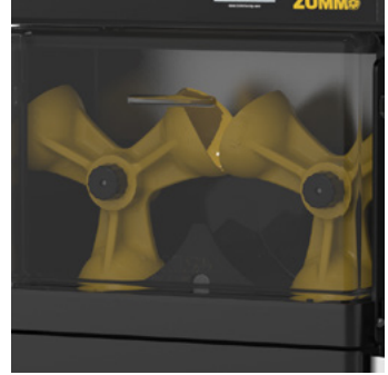
25 fruits per minute