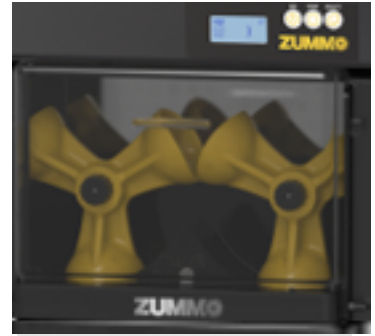
Large kit included