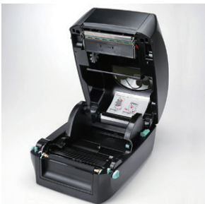
Modern clam-shell design makes it simple to load labels

Advanced multi-purpose 4" desktop printer for light to medium duty applications. With its powerful and reliable features, RT700x is the best choice for retail and industrial applications