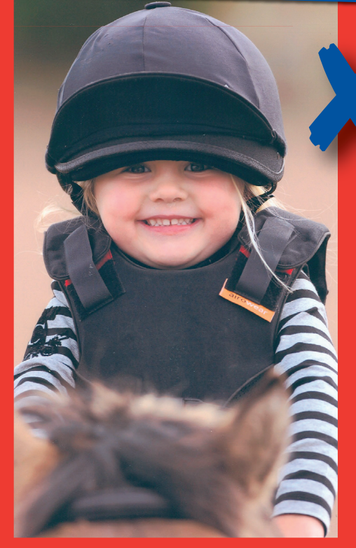
Too high on shoulders and possibly too long at the back. If it touches the saddle it could cause the rider to be unbalanced (hat also too large)