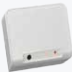
RADION Wireless Glassbreak Detector