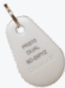
Dual Smart Card & EM Format Token