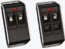
2 Button Keyfob 4 Button Keyfob

Two-button and four-button keyfobs enable system arming and disarming with the option to program custom functions. Portable and fixed-position panic buttons feature one or two buttons to reduce false activation.