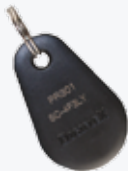
Smart Card Token