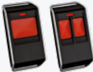
Single Button Panic Transmitter 2 Button Panic Transmitter