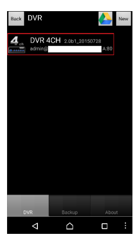
Step 11: Now the app will connect with the DVR and show the live view of the DVR.