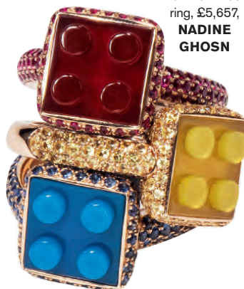
Bon Bon Block ring, £5,657, NADINE GHOSN

The building blocks of life have never been so chic. Pop-culture jeweller extraordinaire, Nadine Ghosn has turned her gem-encrusted hand to a familiar motif for her latest collection: the building block. Once stacked by curious children on the nursery-school floor, the trusty brick is encased in sapphire, jade and 18-carat gold – poised to perfection for eccentric elegance. 'This collection reminds us that any of life's challenges can be overcome – step by step, block by block,' says Ghosn.