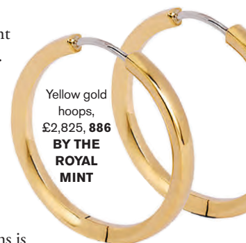
Yellow gold hoops, £2,825, 886 BY THE ROYAL MINT