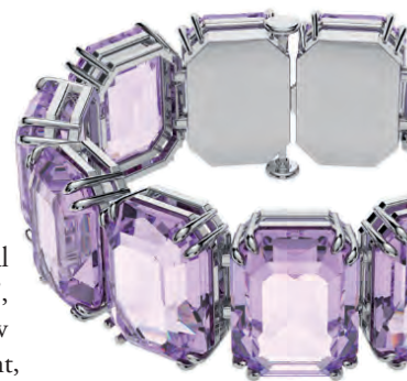
Millenia bracelet, £380, SWAROVSKI

Swarovski is bringing it back to basics – that's delightfully dazzling basics. 'As fundamental to the wardrobe as the white T', according to the house, the new Millenia collection adds a bright, bold and youthful appeal to classic crystal jewellery. Vivid hues emblazon bracelets, necklaces and earrings throughout the eye-catching line, providing an instant playful panache to any ensemble.