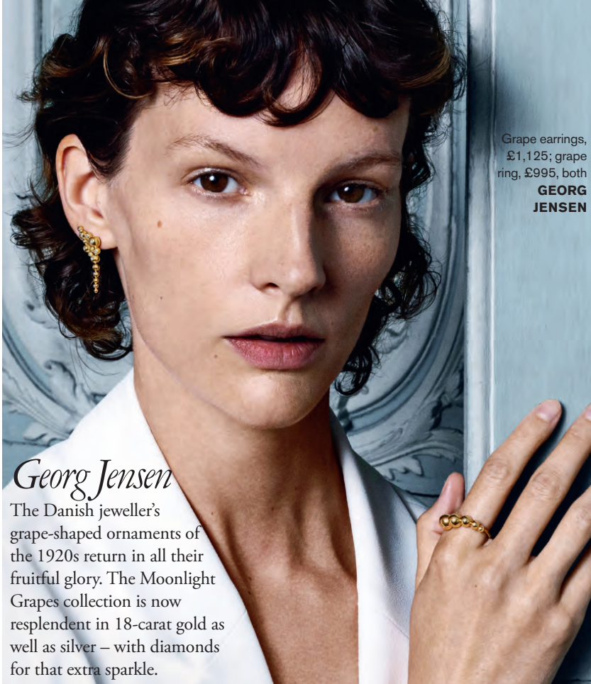
Grape earrings, £1,125; grape ring, £995, both GEORG JENSEN