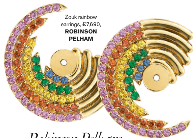
Zouk rainbow earrings, £7,690, ROBINSON PELHAM