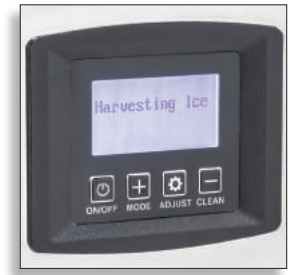
Digital Controller Display