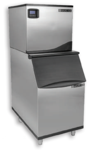
MIM360 ON MIB310N BIN