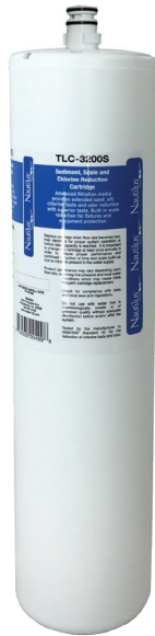
TLC-3200S Replacement Cartridge