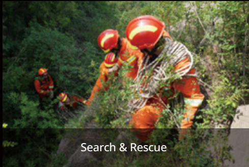
Search & Rescue