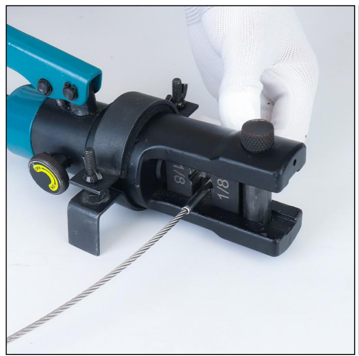
Step3 - Put in the terminal.