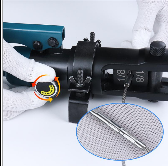
Step5 - Press the handles repeatedly until the terminal is fully swaged.