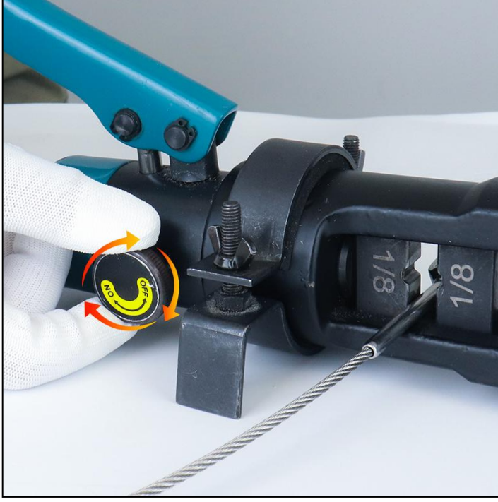
Step4 - turn on the knob.