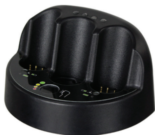
2 Charging Bays

Paddle - Designed to be used with the unit and provide protection against laser emissions. Ensure the paddle is positioned between the laser source and your line of sight before laser emissions occur.