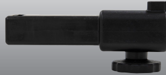
PART 2 CROSSBAR