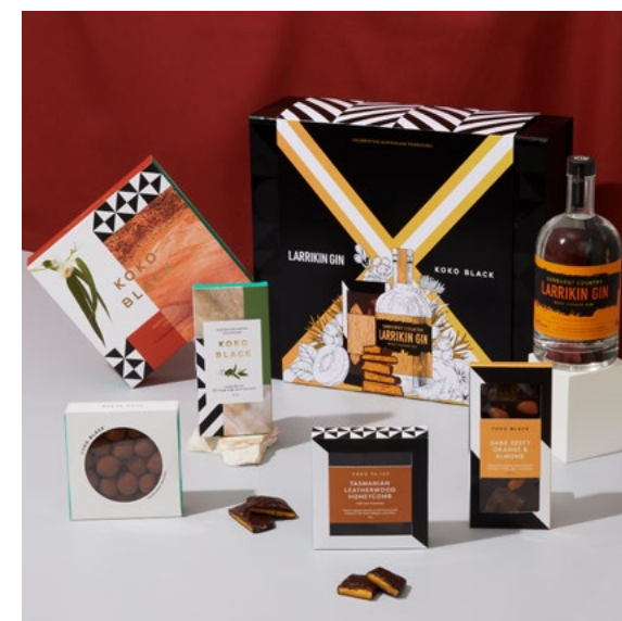
Koko Black x Larrikin Gin