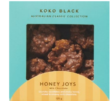
Honey Joys 125g