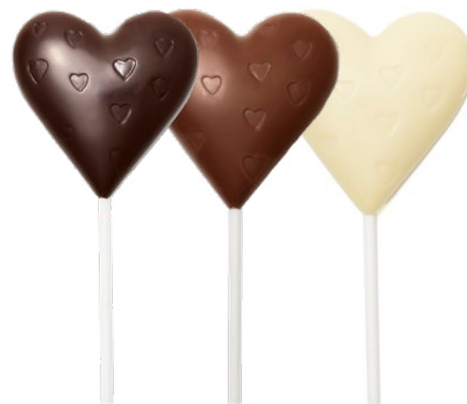
Heart Pops 54% Dark, Milk, White Chocolate