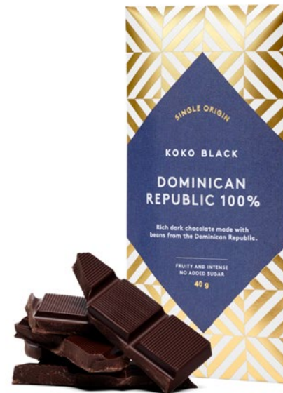
Dominican Republic 100%