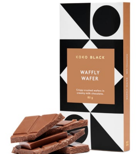
Waffly Wafer Milk Chocolate