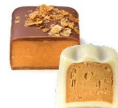
2. Hazelnut Crisp & Caramelised Coconut