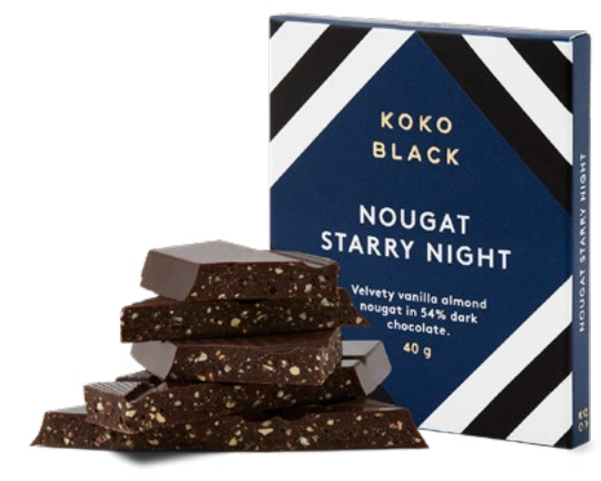
NOUGAT STARRY NIGHT 40g