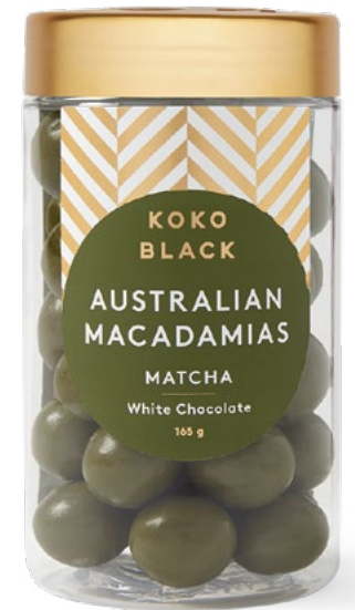
Australian Macadamias Matcha