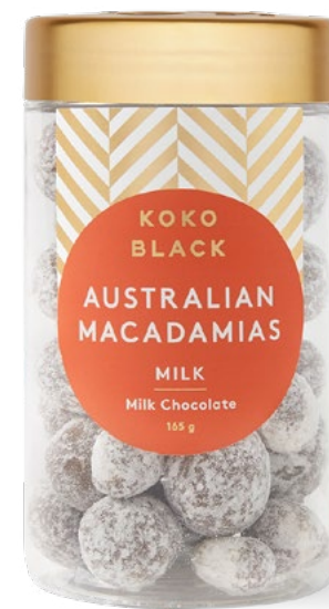
Australian Macadamias Milk