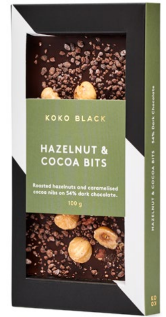
Hazelnut & Cocoa Bits 54% Dark Chocolate