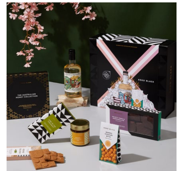
Koko Black x Reed & Co