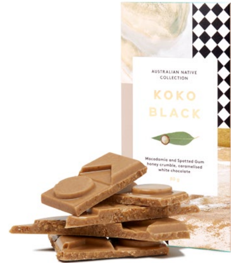
Macadamia & Spotted Gum Honey Caramelised White Chocolate