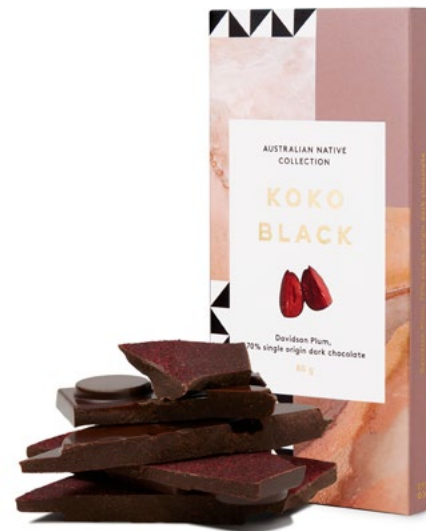
Davidson Plum Single Origin 70% Dark Chocolate