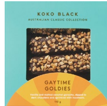
Gaytime Goldies 110g