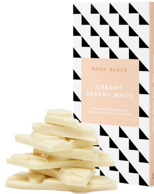
Creamy Dreamy White White Chocolate