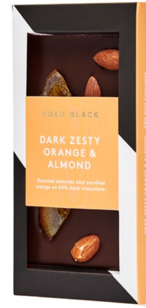
Dark Zesty Orange & Almond 54% Dark Chocolate