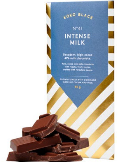
N°41 Intense Milk