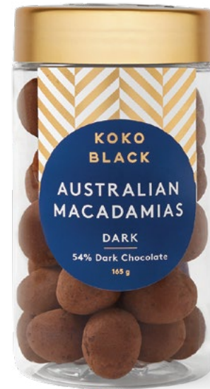
Australian Macadamias Dark