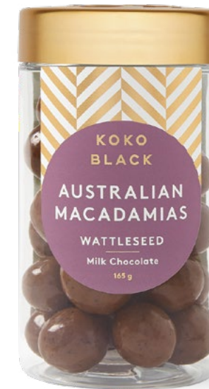
Australian Macadamias Wattleseed