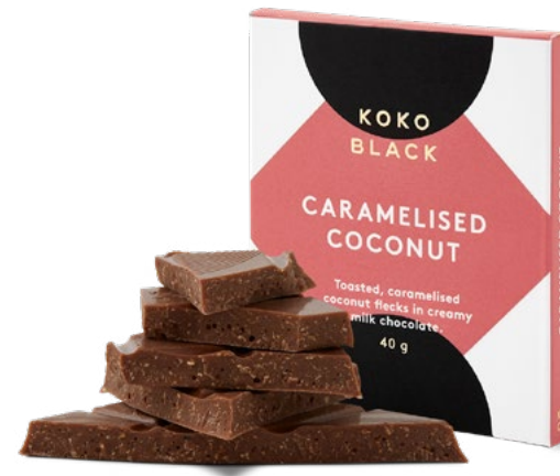
CARAMELISED COCONUT 40g