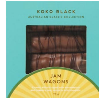
Jam Wagons 90g