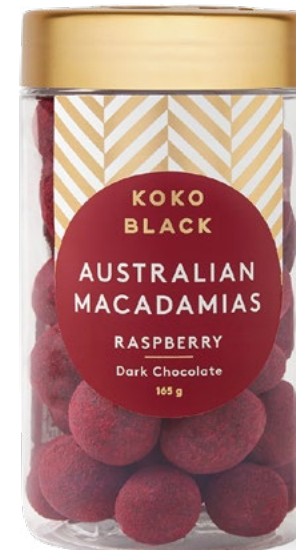
Australian Macadamias Raspberry