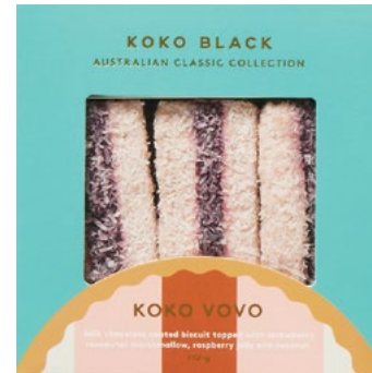
Koko Vovo 110g