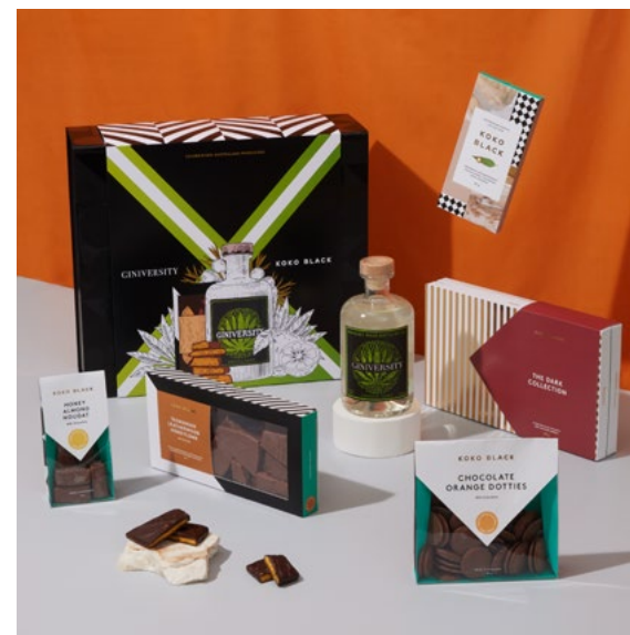
Koko Black x Giniversity