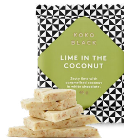
LIME IN THE COCONUT