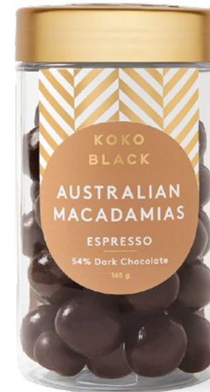
Australian Macadamias Espresso