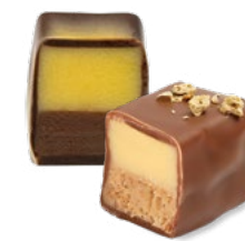
4. Passion & Zesty Lemon Tart