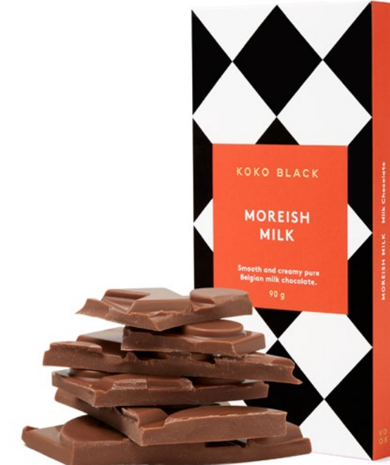
Moreish Milk Milk Chocolate