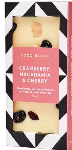
Cranberry, Macadamia & Cherry Milk/White Chocolate