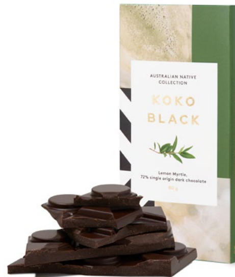
Lemon Myrtle Single Origin 72% Dark Chocolate