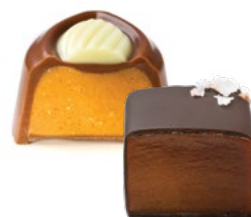
1. Almond & Dark Salted Caramel