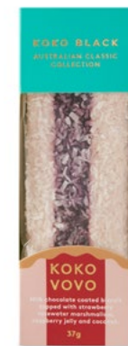
Koko Vovo 37g