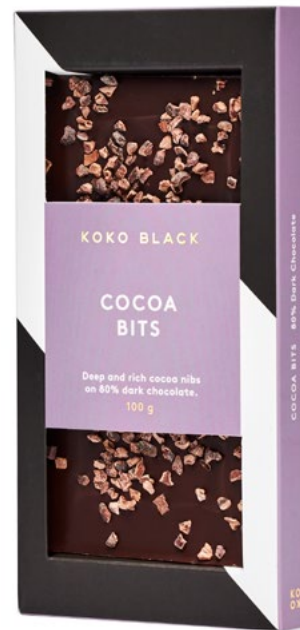
Cocoa Bits 80% Dark Chocolate