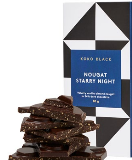
Nougat Starry Night 54% Dark Chocolate