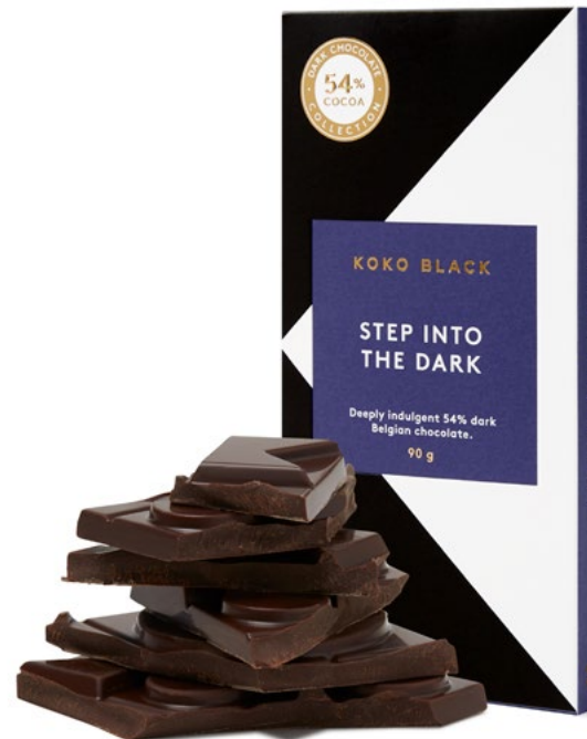
Step into the Dark 54% Dark Chocolate