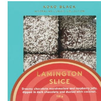
Lamington Slice 150g