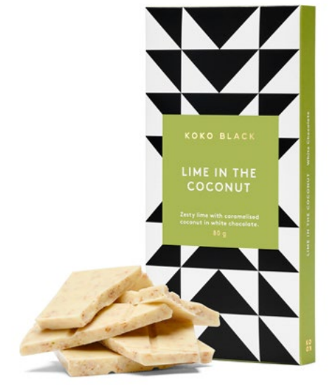
Lime in the Coconut White Chocolate