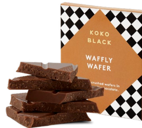
WAFFLY WAFER 40g