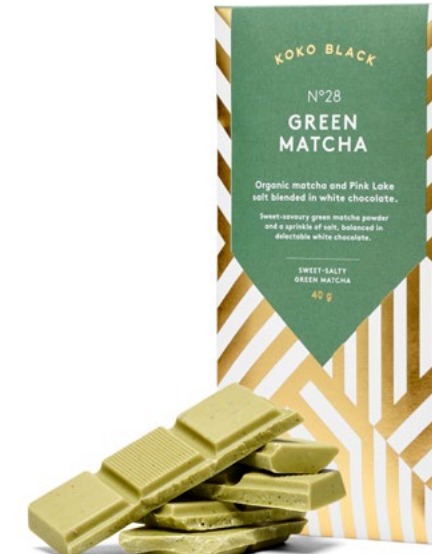
N°28 Green Matcha