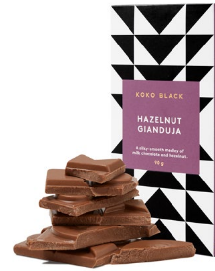
Hazelnut Gianduja Milk Chocolate