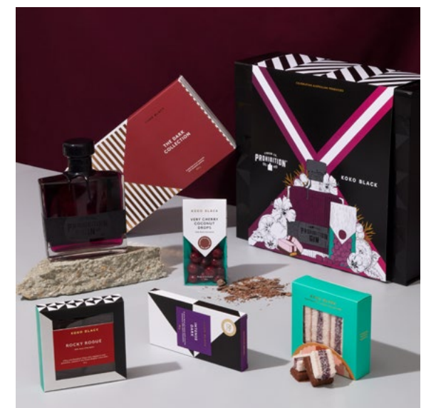
Koko Black x Prohibition