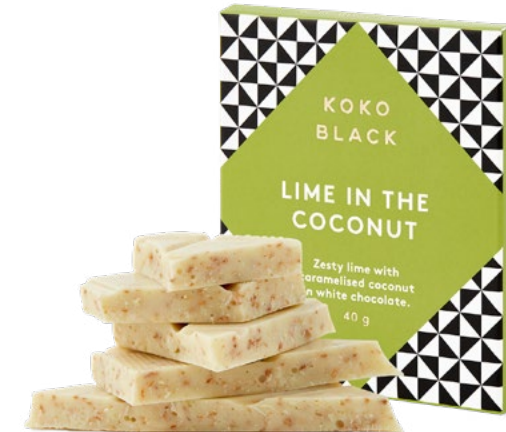
LIME IN THE COCONUT 40g