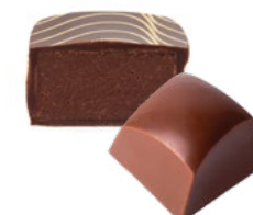
3. Dark Raspberry Ganache & Cafe Latte