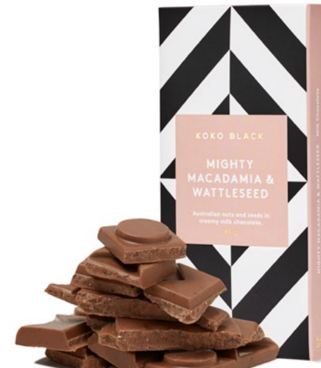
Mighty Macadamia & Wattleseed Milk Chocolate