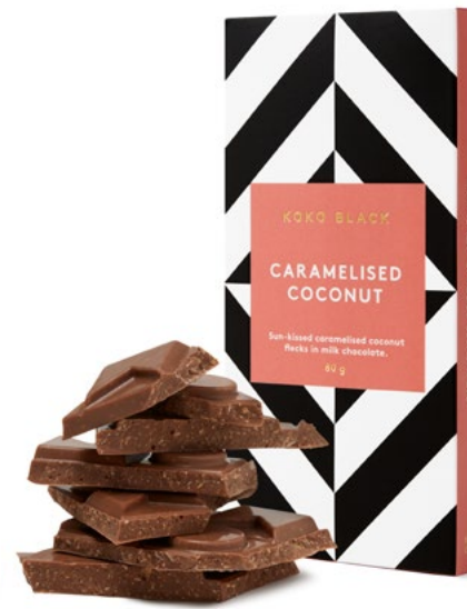
Caramelised Coconut Milk Chocolate