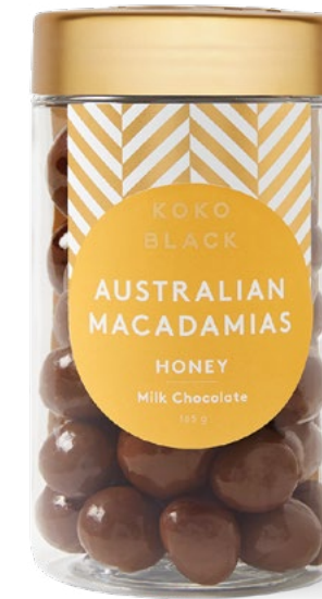
Australian Macadamias Honey