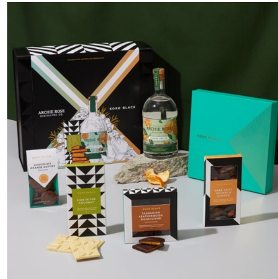
Koko Black x Archie Rose

Celebrating Australian producers. Explore our limited-edition collaboration of Koko Black handcrafted chocolates uniquely paired with 9 premium boutique distillers.