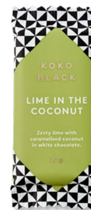
LIME IN THE COCONUT