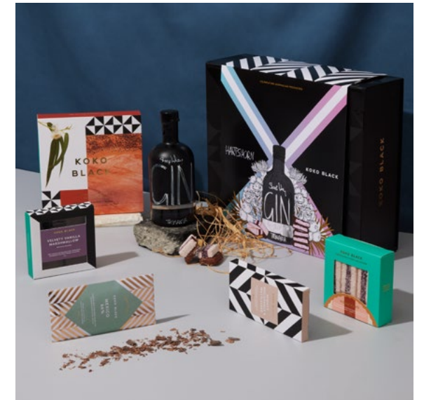
Koko Black x Hartshorn