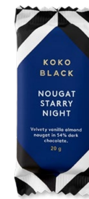
NOUGAT STARRY NIGHT