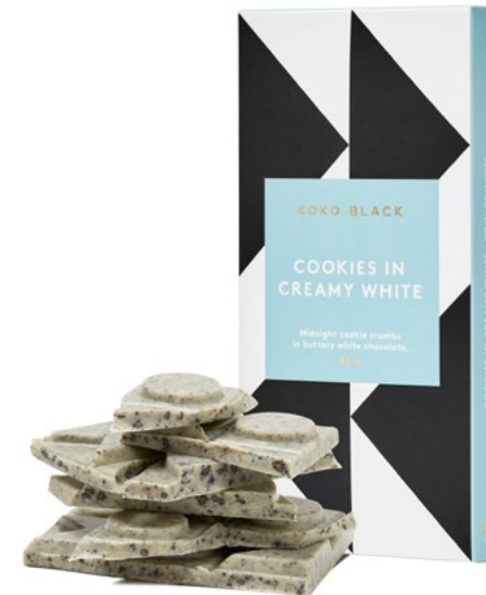
Cookies in Creamy White White Chocolate