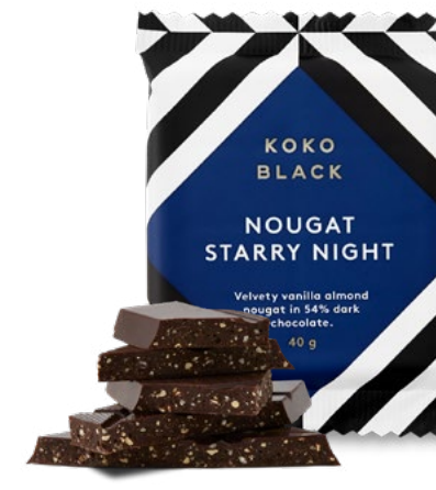
NOUGAT STARRY NIGHT