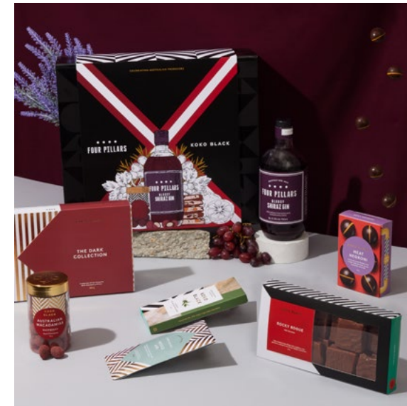
Koko Black x Four Pillars