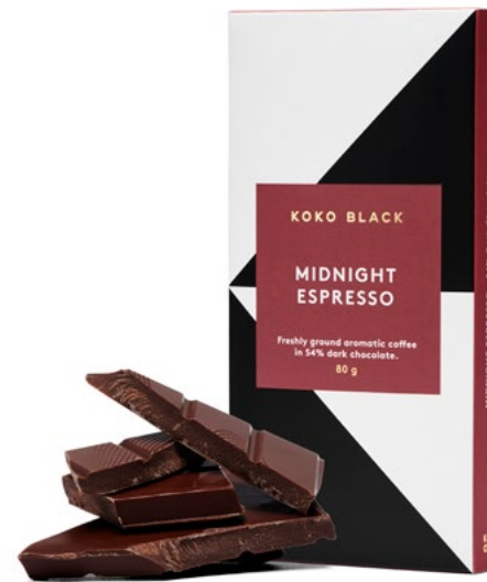
Midnight Espresso 54% Dark Chocolate