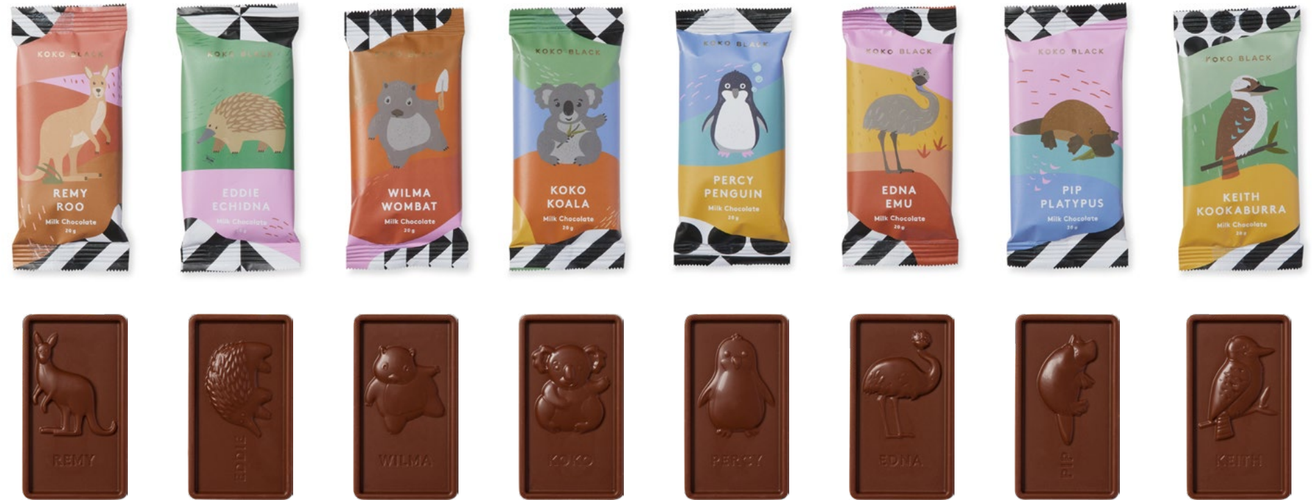
Koko Critter Mini Blocks 8 Australian Critters to discover