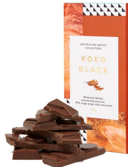
Whipstick Wattle & Roasted Coconut Single Origin 39% Milk Chocolate