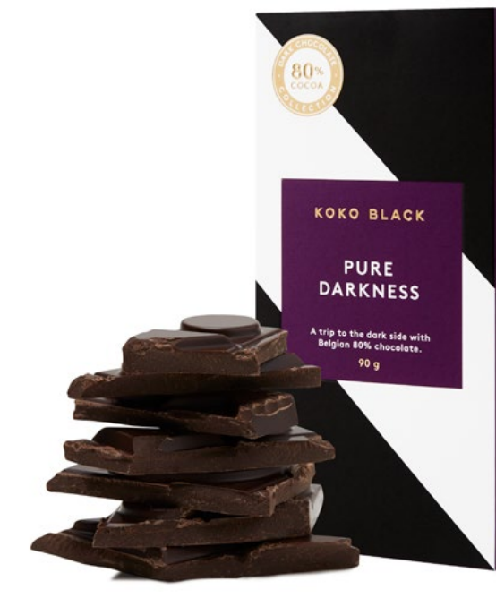
Pure Darkness 80% Dark Chocolate