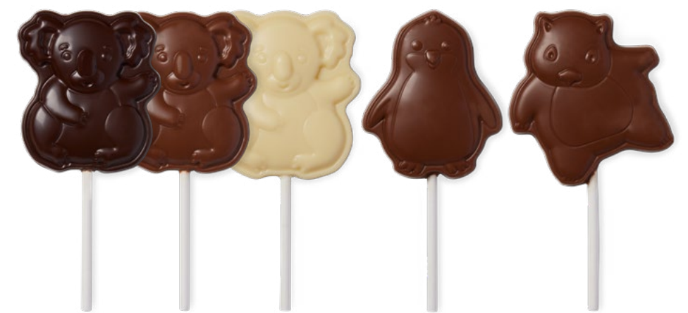
Critter Pops 54% Dark, Milk, White Chocolate