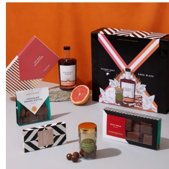
Koko Black x Patient Wolf