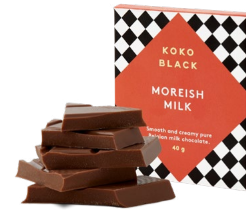
MOREISH MILK 40g