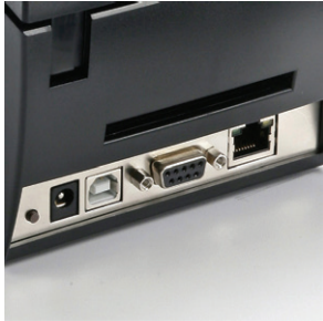
Ethernet, Serial and USB are standard features adding flexibility and power