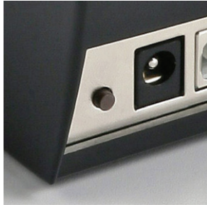
Innovative "C" button makes label Calibration simple and fast