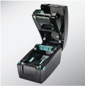
Modern clam-shell design makes it simple to load labels