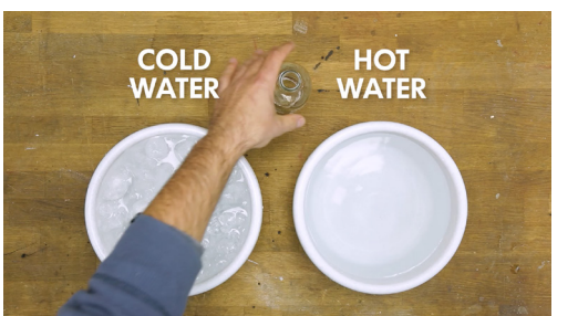
3. Dip the bottle into the cold water at first and afterwards into the warm water.