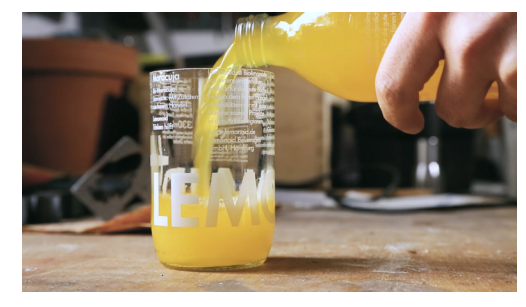
8. or as a drinking glass.