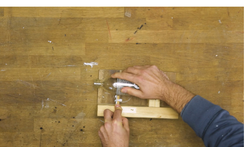
2. Cut off the top of the Lemonaid bottle.