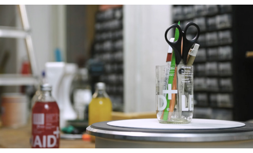
6. Done! Now you can use it as a pen holder,