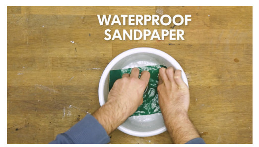
4. Grind the glass into the water.

5. Grind the glass again ouside the water.