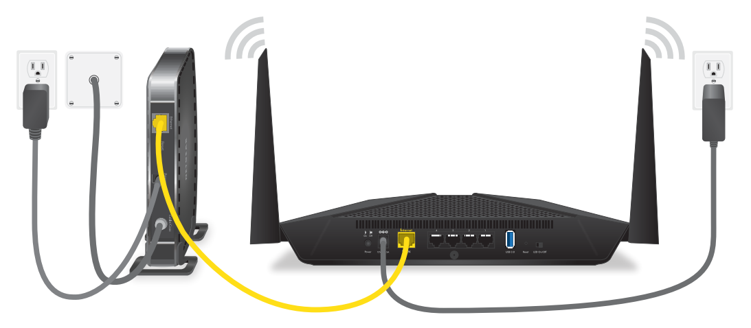
Figure 5. Cable your router

Power on your router and connect it to a modem.