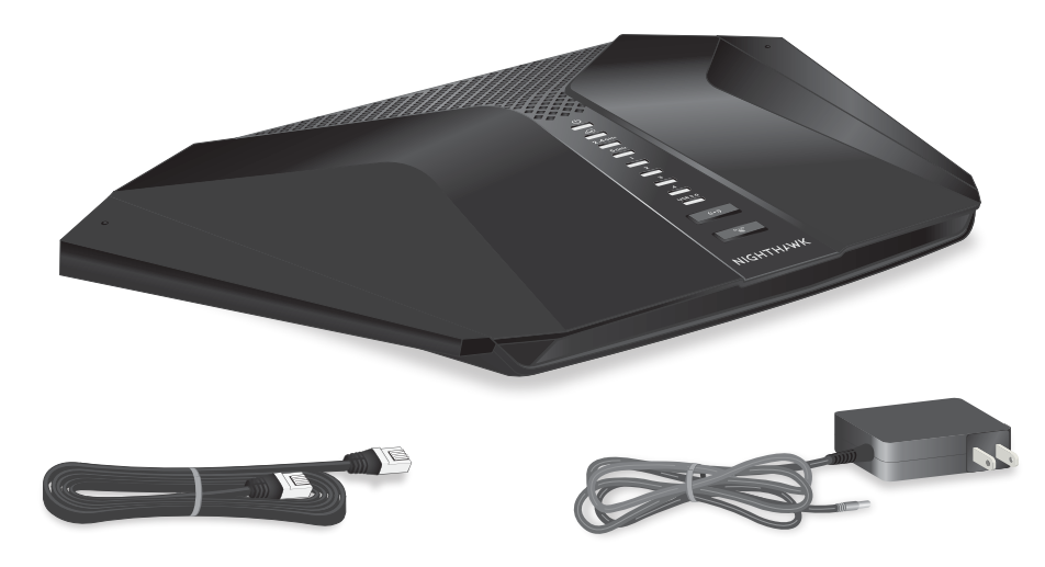
Figure 1. Package contents

Your package contains the router, the power adapter, and an Ethernet cable.