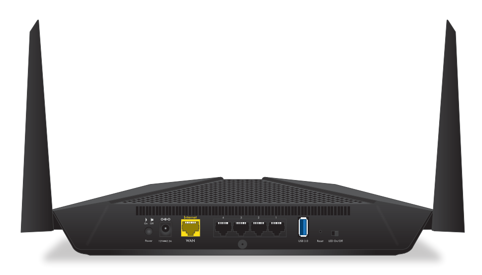
Figure 3. Rear panel

The following figure shows the rear panel connectors and buttons.