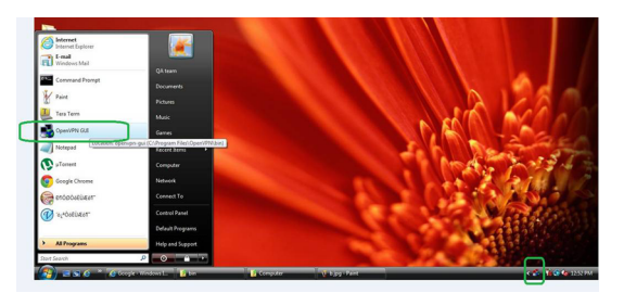
The OpenVPN icon displays in the Windows taskbar.

1. Launch the OpenVPN application with administrator privileges.