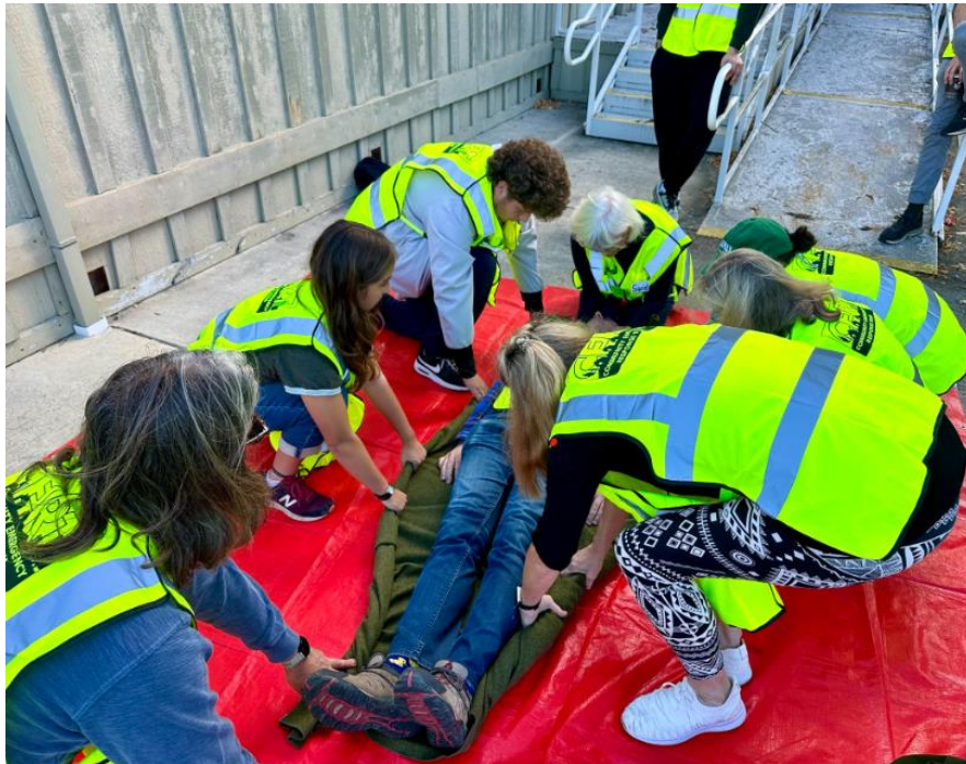
Above: CERT students learn to move a patient using a common blanket for a stretcher. Below: Students learn to apply a leg splint.

28 Citizens Graduate the October CERT Class! In another outstanding example of community support, 28 citizens have graduated the most recent CERT basic training that was completed in October. These citizens will make excellent additions to our CERT response group. We are also proud to report that four members of the Monterey High School Navy-ROTC program are among these graduates and will greatly strengthen our CERT presence at the High School.